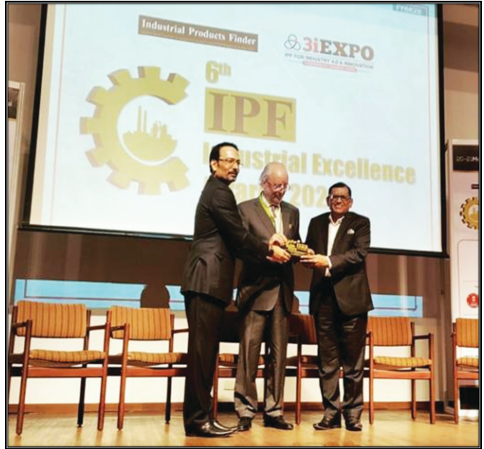
Fastest Growing Company (Medium –Auto Ancillary) awarded by IPF Industrial Excellence