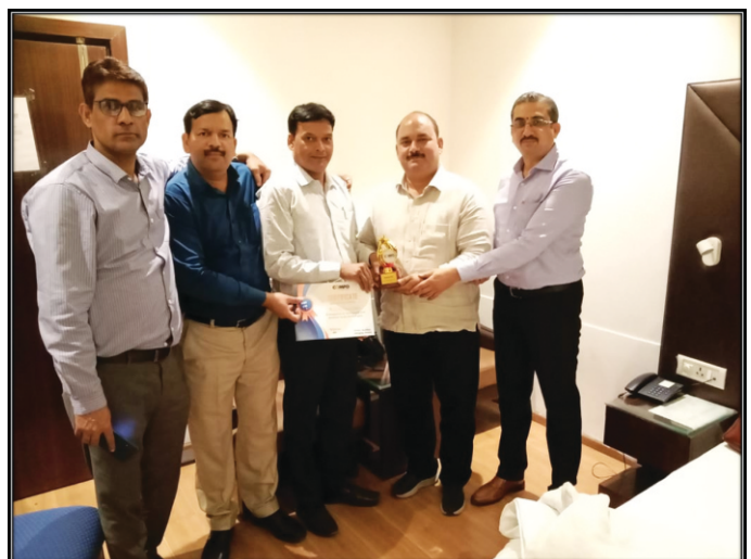
Recognition to Sales (aftermarket) Achievers in the year 21-22