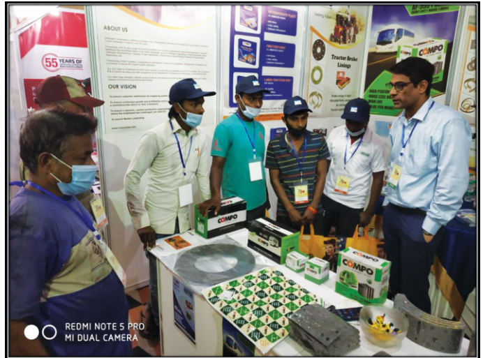
Our participation at ACMA Expo at Guwahati in December, 2021