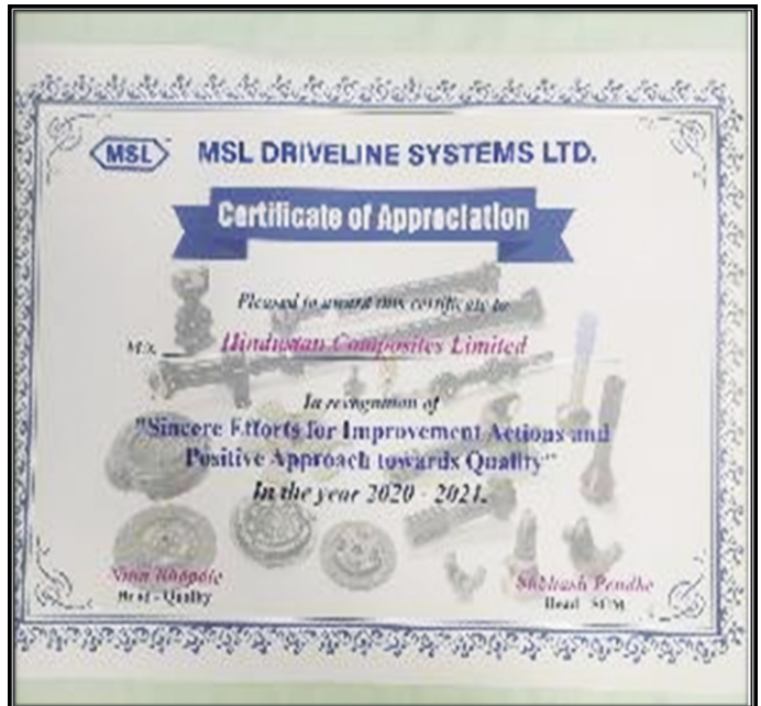
Award from MSL Driveline for Product improvement and quality