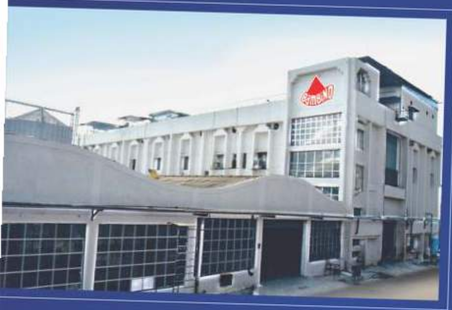
▶ Gurgaon Factory