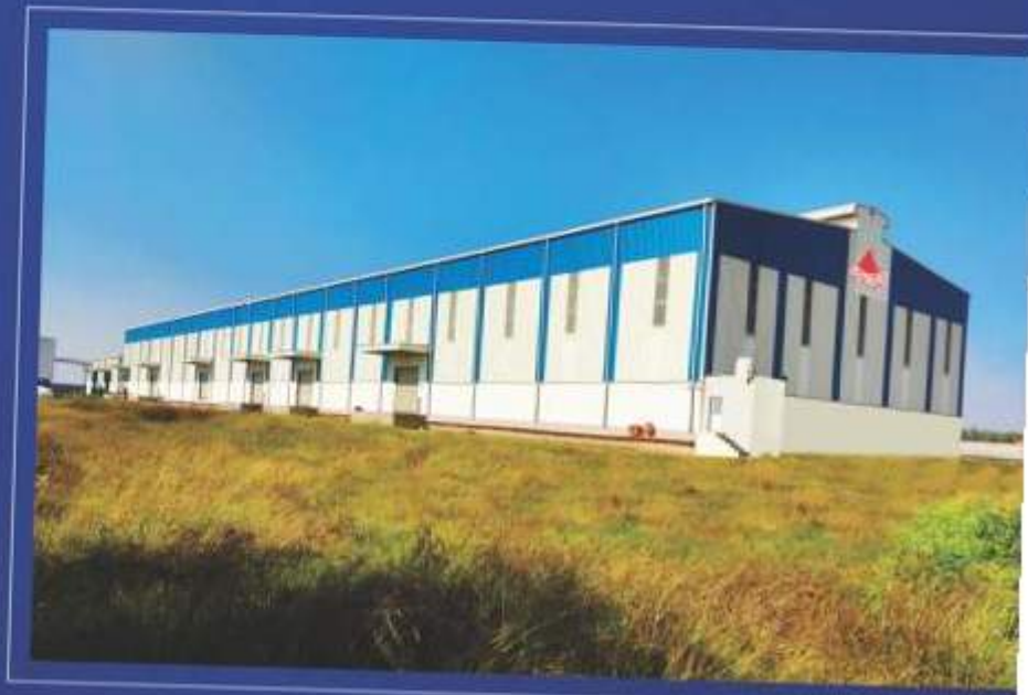
Gohana ▶ Factory