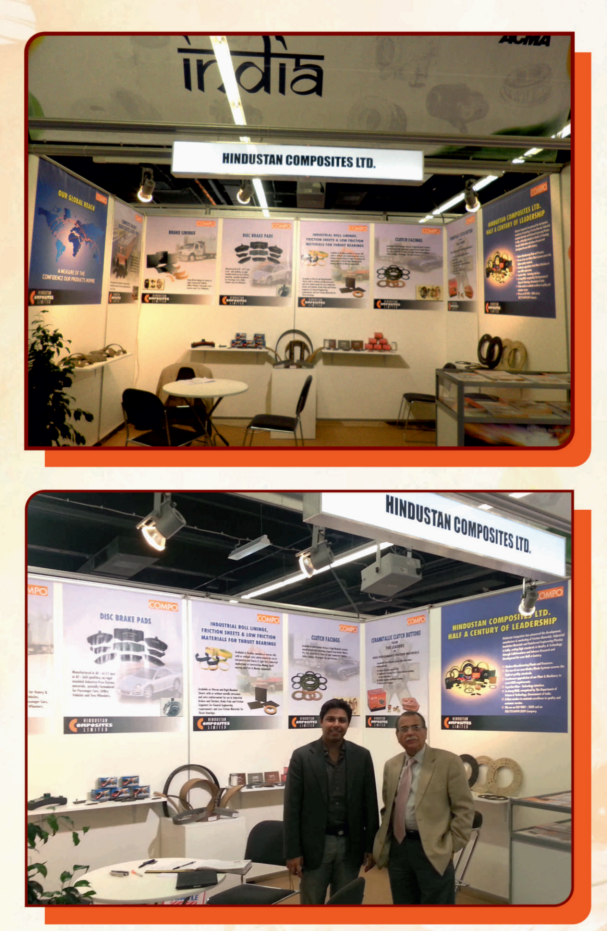
"Our participation in Auto Mechanika Exhibition, 2012 the largest Auto-Component Exhibition held at Frankfurt, Germany"