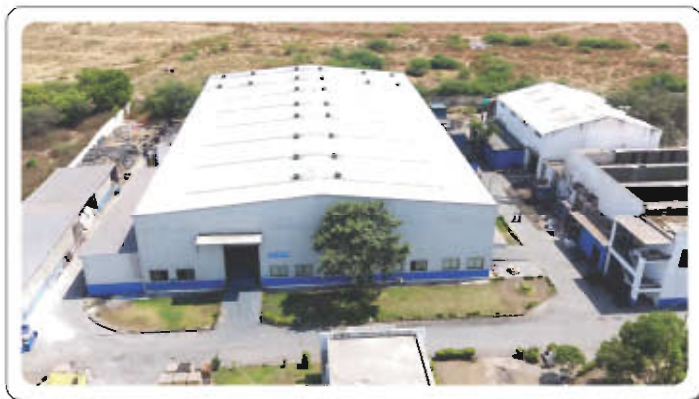
CV manufacturing at Paithan