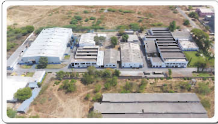
Paithan Plant Ariel View