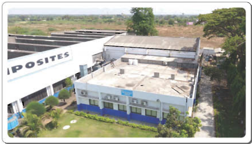
Technology center at Paithan