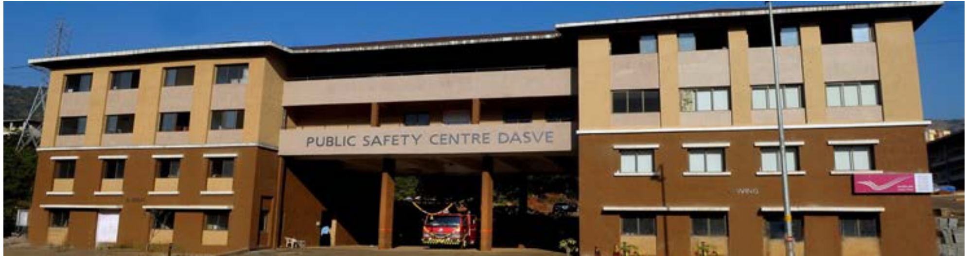
Public Safety Centre - Dasve