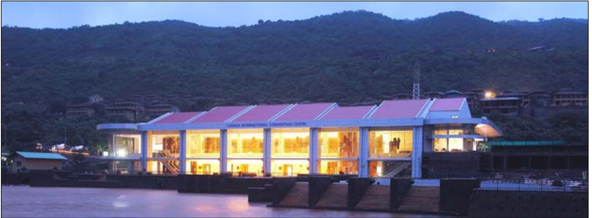
Lavasa International Convention Centre