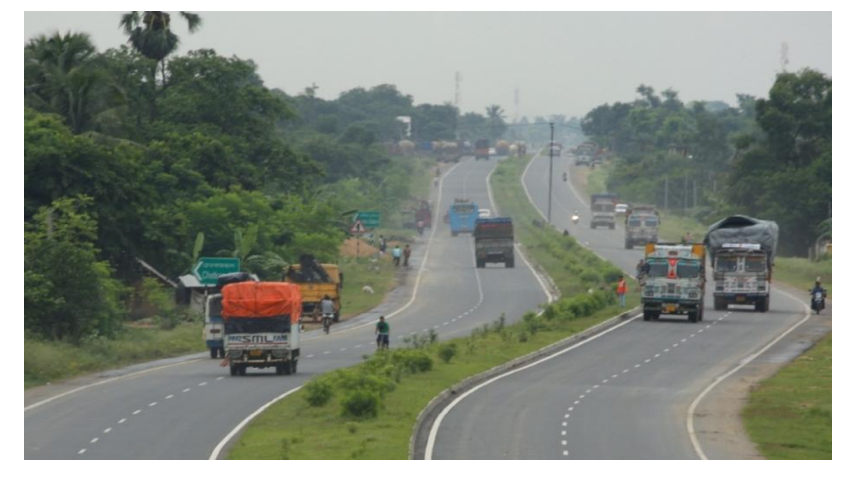
Km 341 (Farakka Raiganj Highway)