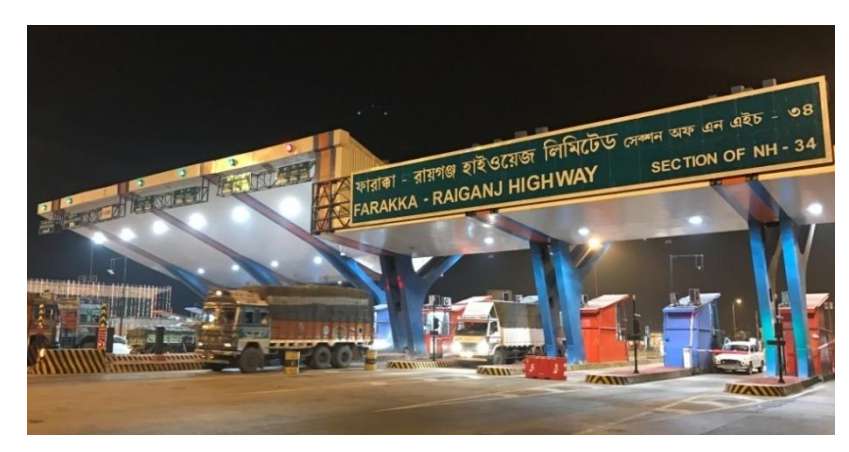
Farakka Raiganj Highway: Toll Plaza at Km 297