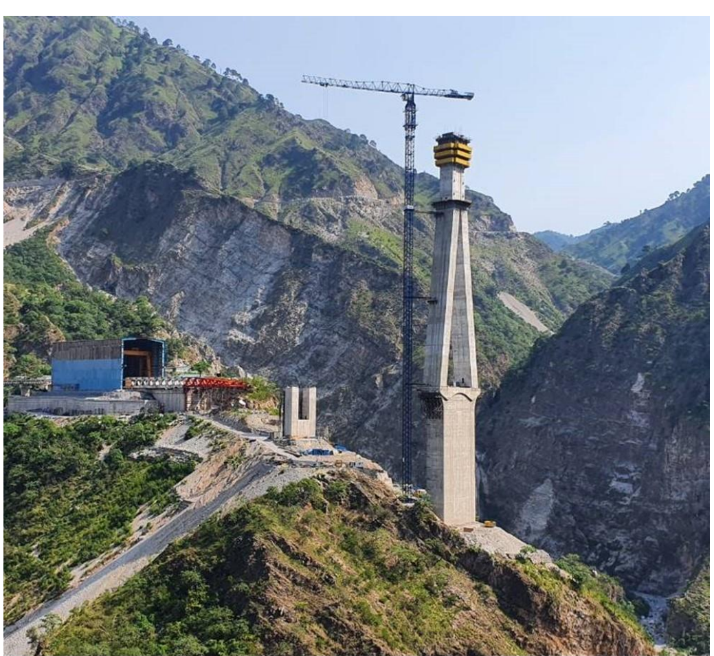
Anjikhad Bridge - Main Pylon construction completed 150m out of 193m