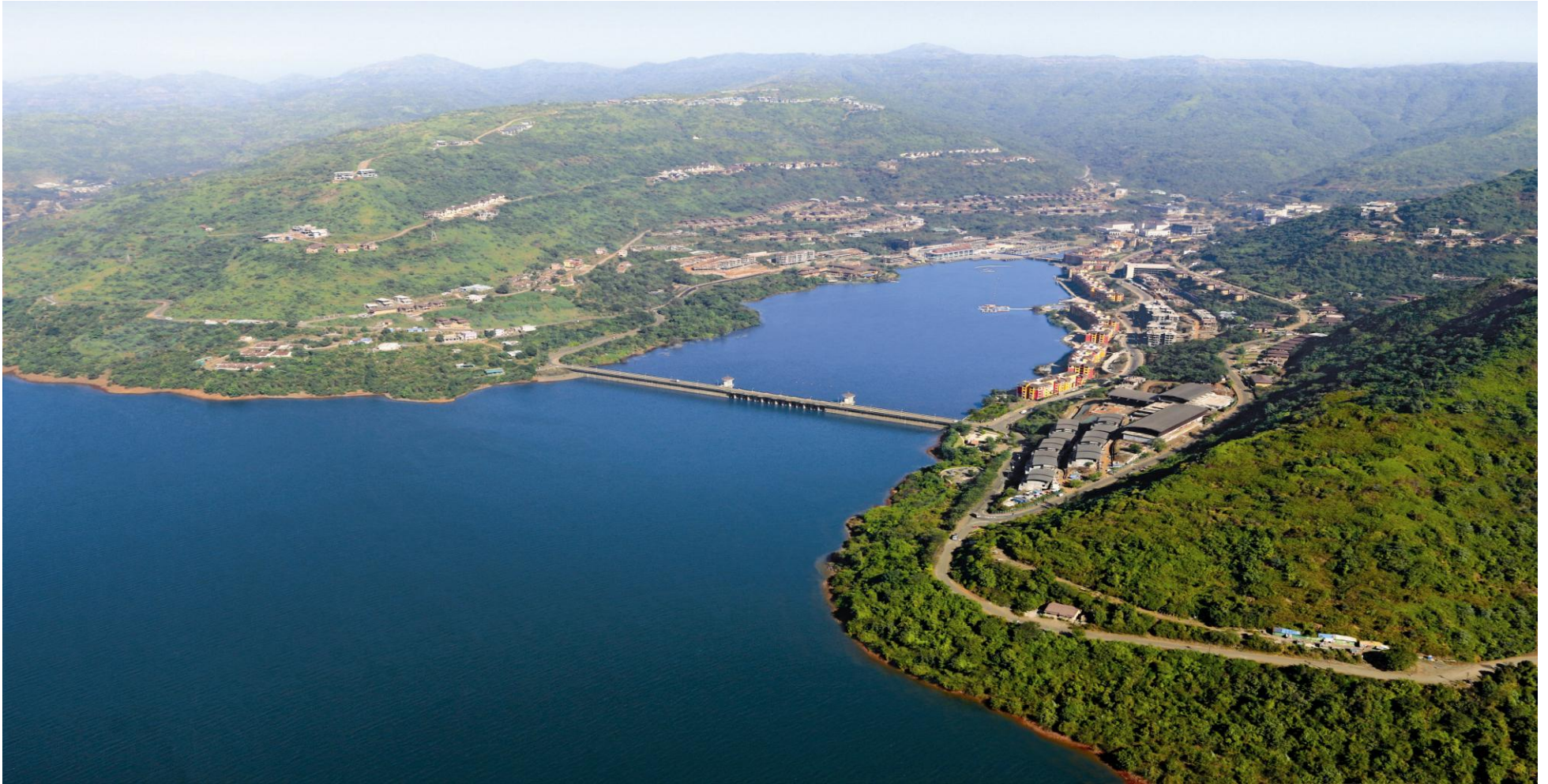
Aerial View of Dasve