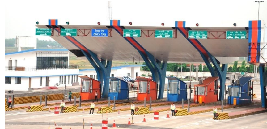
Package 3 Toll Plaza at Km 206