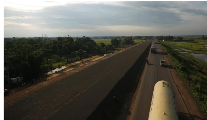
Construction underway at Package 4