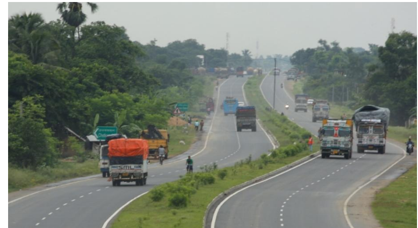
Km 341 (Farakka Raiganj Highway)