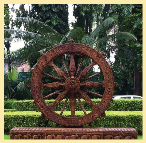
Entrance of The Leela Mumbai