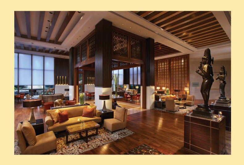
Lobby Lounge at The Leela Mumbai

To not just satisfy our guests, but delight them. To show the warmth and grace unique to Indian hospitality. To set a new global standard of service in which wishes are not simply granted, but anticipated.