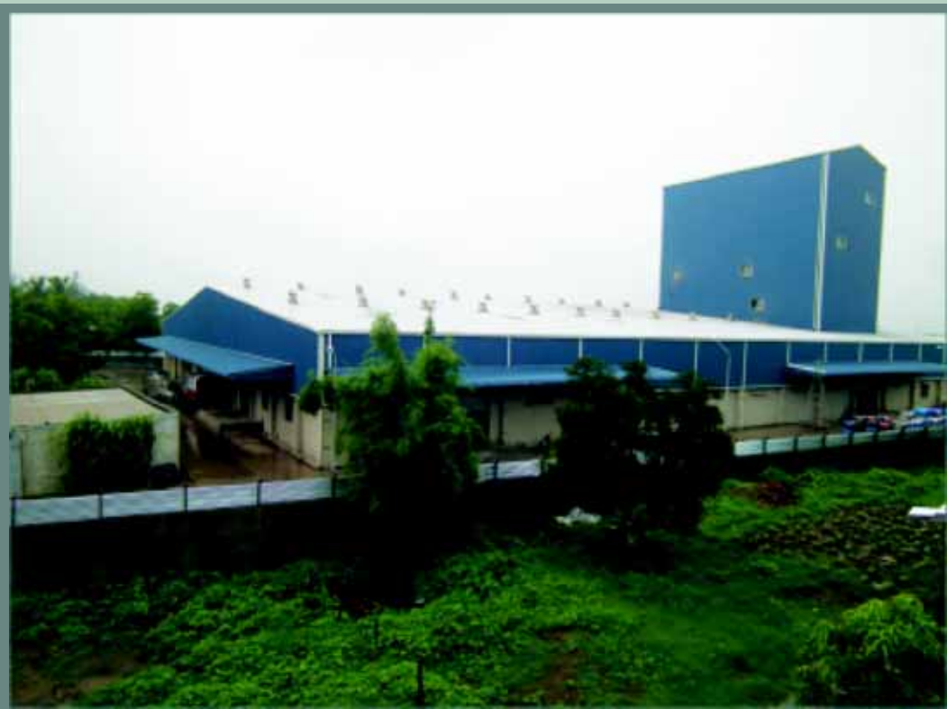
Shrimp Feed Manufacturing Plant at Village Balda, Gujarat.