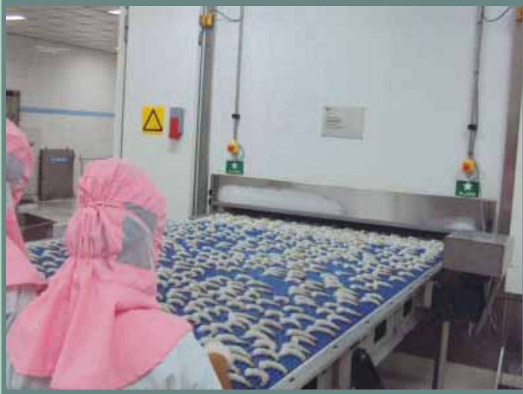
New IQF machine in operation at Shrimp Processing Plant at Gopalapuram, Andhra Pradesh.