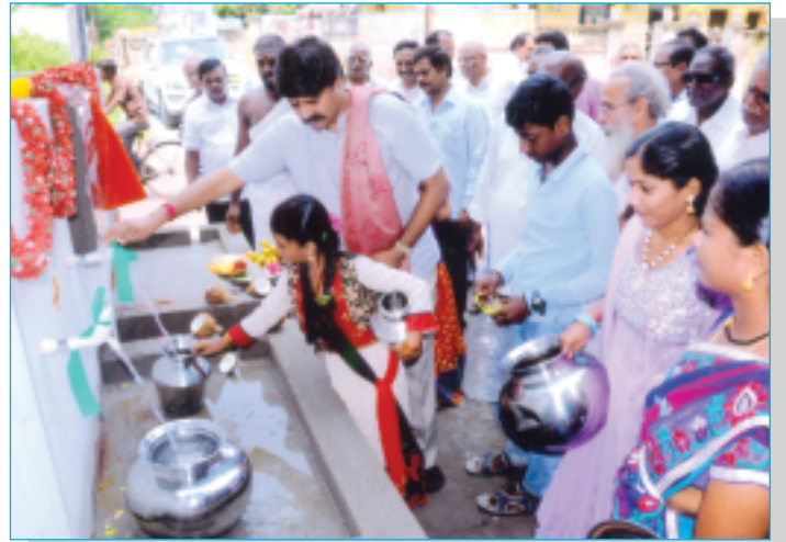
Supply of safe drinking water by installing RO plant in Gautami Nagar locality at Kovvur under NTR Sujala Scheme of Govt. of AP.