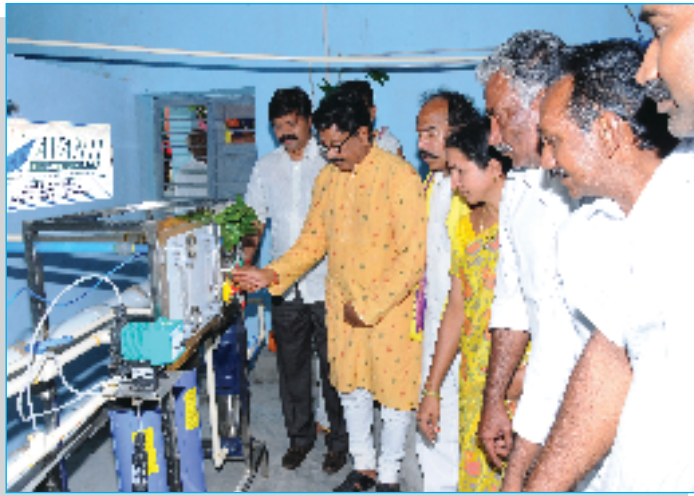
Supply of safe drinking water by installing RO plant in Pasivedala Village under NTR Sujala Scheme of Govt. of AP.