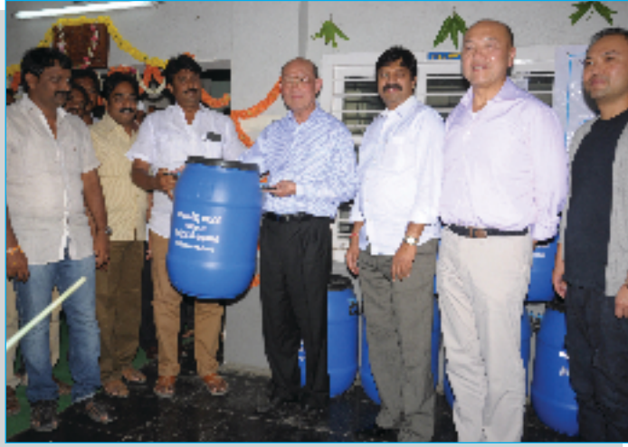
Donating garbage bins to Kovvur Municipality as a part of Swachh Bharat cleanliness drive.