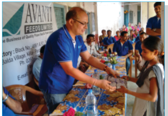
Distribution of uniforms to school children at Balda Village in Gujarat.