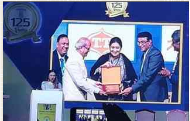
T.T. Limited Chairman & MD receives Hosiery Legend Award by Honourable Textile Minister Smt Smriti Irani