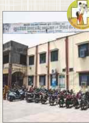
Sugani Devi Jesraj Baid Hospital & Research Centre