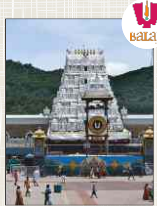
Sri Venkateswara Nitya Anna Danam Trust, Tirupati