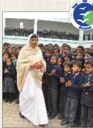
Veerayatan “जहाँ जिनालय - वहाँ विद्यालय”