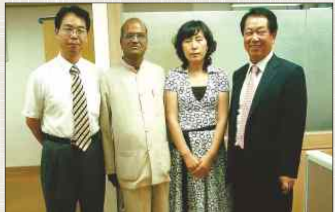
Chairman with Korean Customer