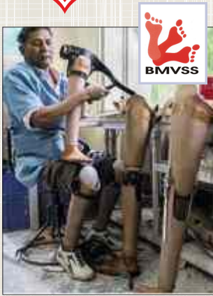
Bhagwan Mahavir Viklang Shayata Samiti