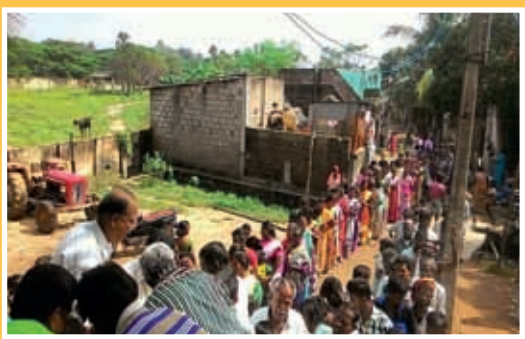
Free food distribution to Chennai Flood Victims