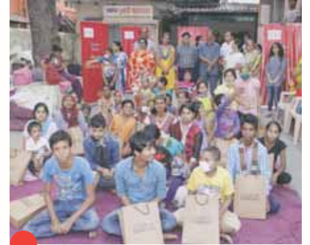
Kokuyo Camlin celebrating Children's day with cancer-affected kids