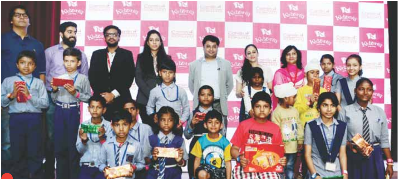
Distribution of gifts to underprivileged children in an event 'Unwrapping Happiness' at Kidzania Noida