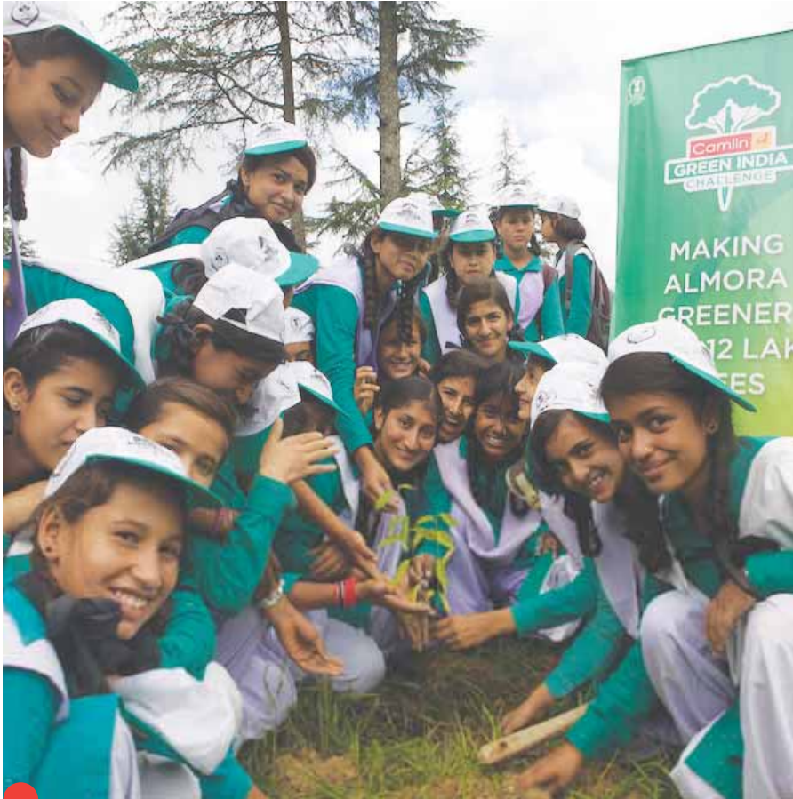
Tree plantation at Pithoragarh, Uttarakhand