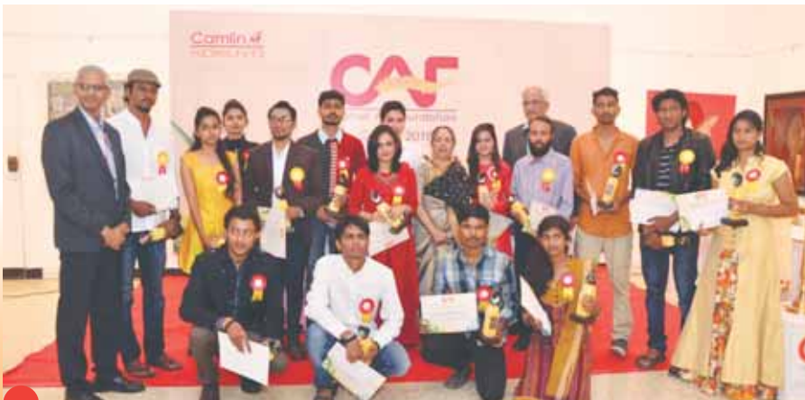
Prize winners of Camlin Art Foundation Contest 2016