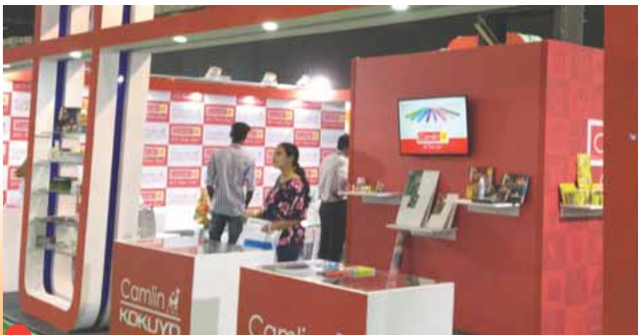
Kokuyo Camlin stall at Gifts and Accessories exhibition in Mumbai