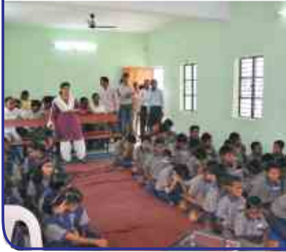
Construction of class room at Dnyan Jyoti Blind School, Nagalwadi, Nagpur