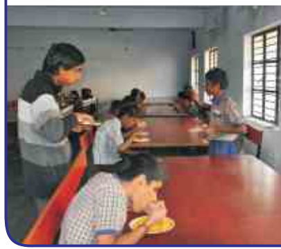
Construction of dining hall at Dnyan Jyoti Blind School