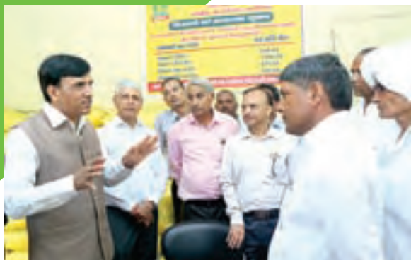
Sh. Mansukh L. Mandaviya, Hon'ble Minister of State for Chemicals & Fertilizers, Road Transport & Highways and Shipping alongwith C&MD during interaction with farmers at NFL Kisan Suvidha Kendra, Panipat