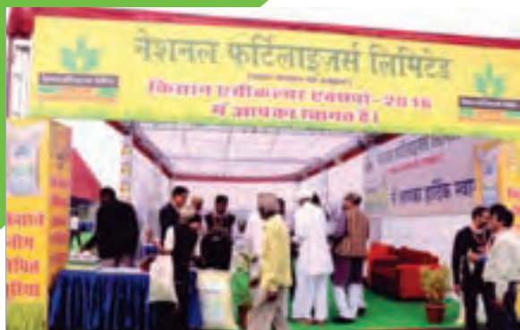
NFL showcasing its products at stall in Farmers Agricultural Expo-2016