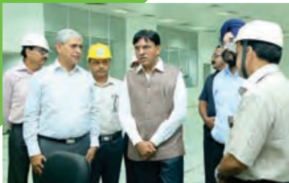
Sh. Mansukh L. Mandaviya, Hon'ble Minister of State for Chemicals & Fertilizers, Road Transport & Highways and Shipping along with C&MD and senior officials of the company during a visit to Panipat Plant