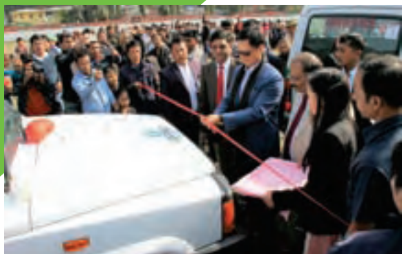
Shri Kiren Rijju, Hon'ble MoS (Home Affairs) along with senior officials of NFL during the handing over of Ambulances to District Administration, Seppa, Arunachal Pradesh