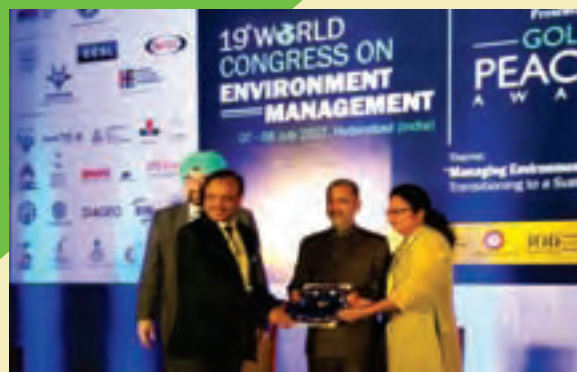
Panipat Unit received Golden Peacock Award 2017 for Energy Efficiency from Institute of Directors.