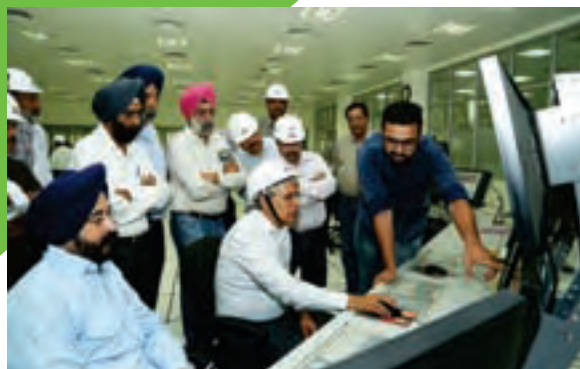
C&MD & Director (T) in Ammonia Control Room at Bathinda Plant