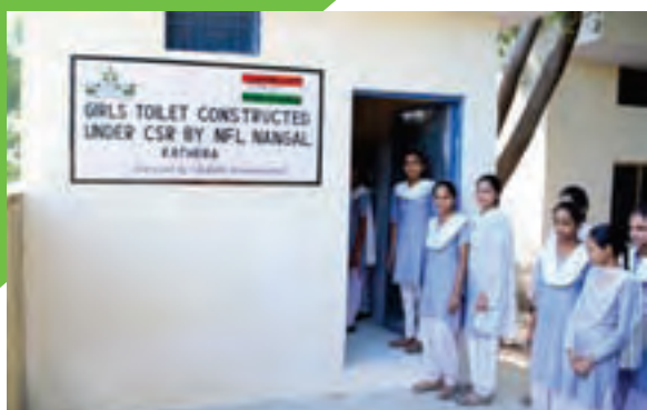
Toilets constructed in Government Schools under Swachh Bharat Mission in Nangal