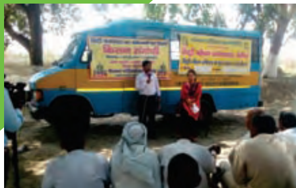
NFL officials interacting with farmers during soil testing camp