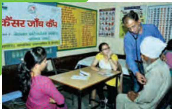
A view of Cancer awareness & screening camp organised under CSR at Bathinda