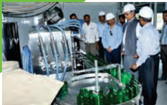
C&MD visiting the Bio-fertilizer manufacturing unit at Vijaipur