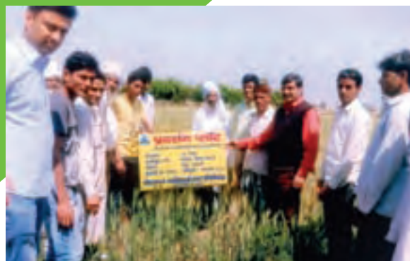
NFL officials with farmers at Demonstration Farm