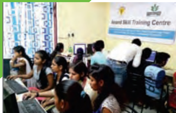
Computer Hardware Technician Training programme for Skill Development of youth organised at Delhi