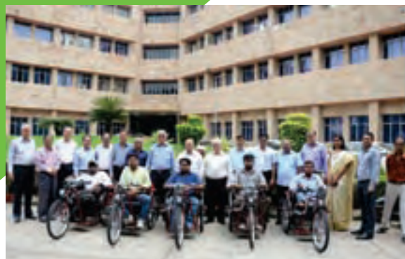
C&MD, Directors and others during distribution of aids & appliances to differently abled persons under CSR in Noida