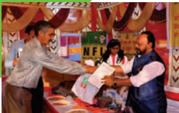
Sh. Anandrao Adsul, Chairman of Parliamentary Standing Committee on Chemicals & Fertilizers distributing Soil Health Cards and Fertilizer Kit prepared by NFL to the farmers at Mandi, H.P.