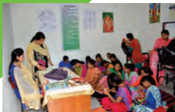
Skill Development Programme in Sticking & Tailoring for women organised at Nangal