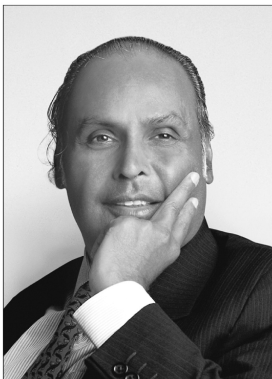
Padma Vibhushan Shri Dhirubhai H. Ambani (28 th December, 1932 – 6 th July, 2002) Reliance Group – Founder and Visionary