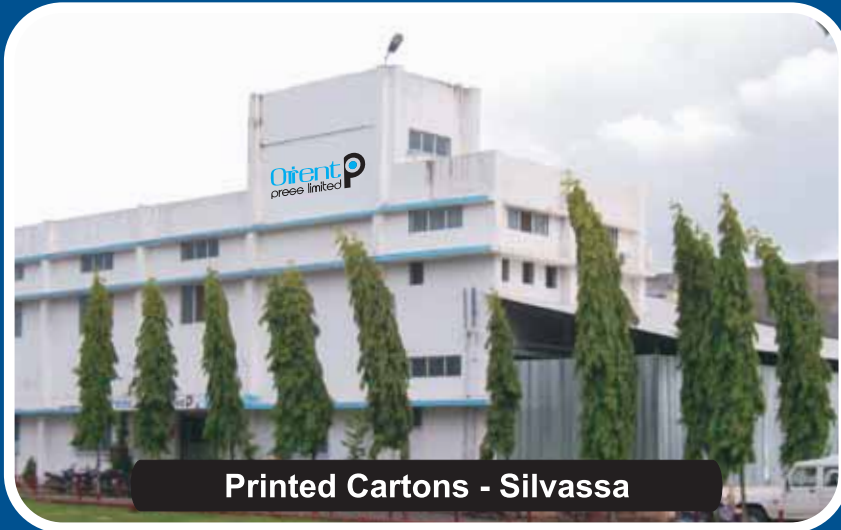
Printed Cartons - Silvassa