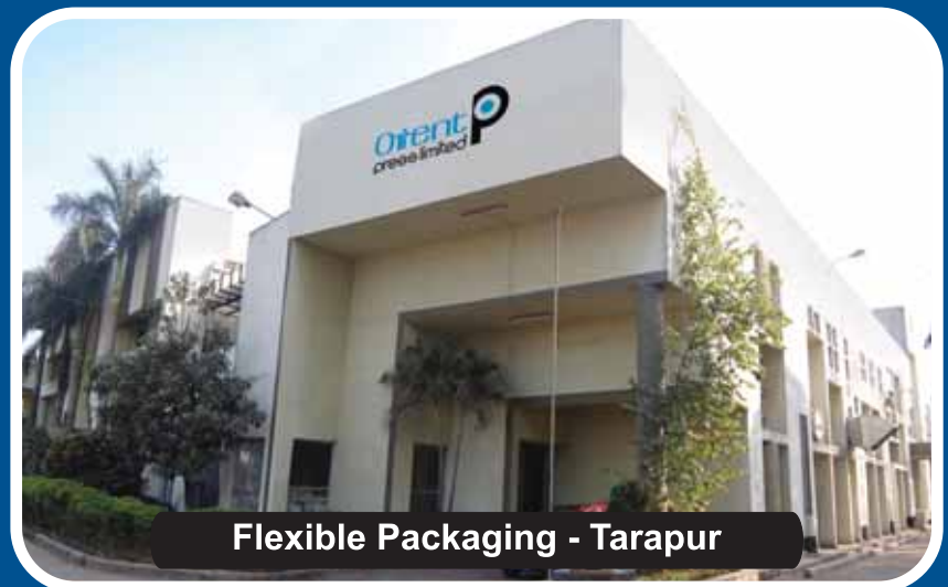
Flexible Packaging - Tarapur