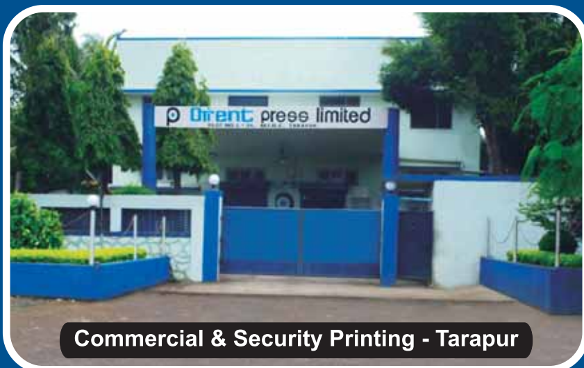
Commercial & Security Printing - Tarapur