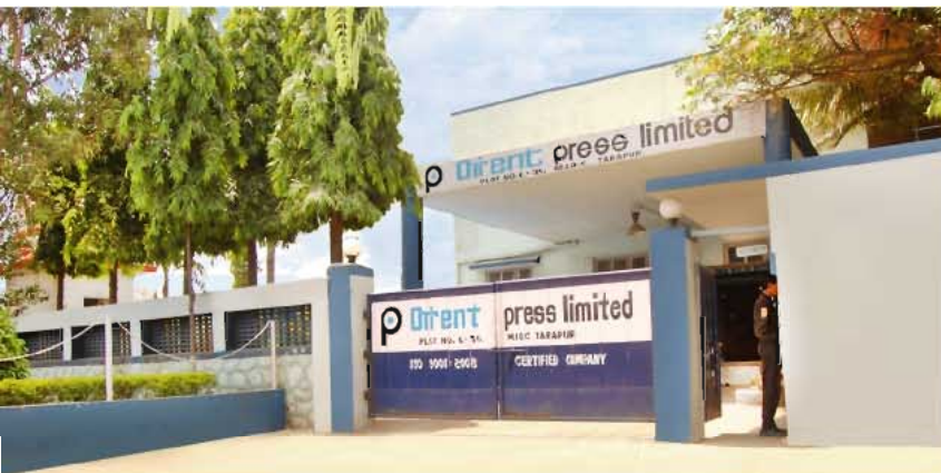
Tarapur Unit - 1