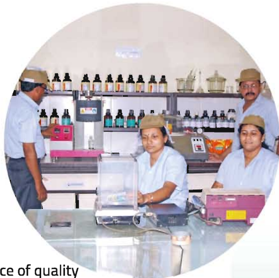
the assurance of quality