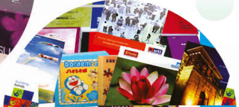
books & stationery