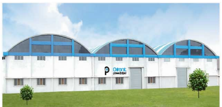
Silvassa Unit - 2