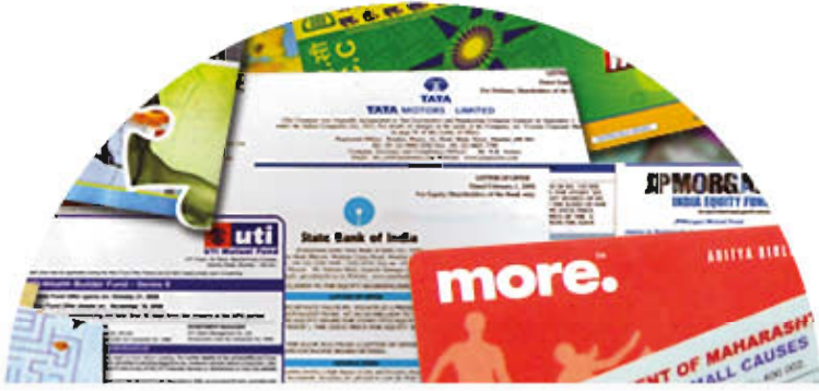
commercial & security printing