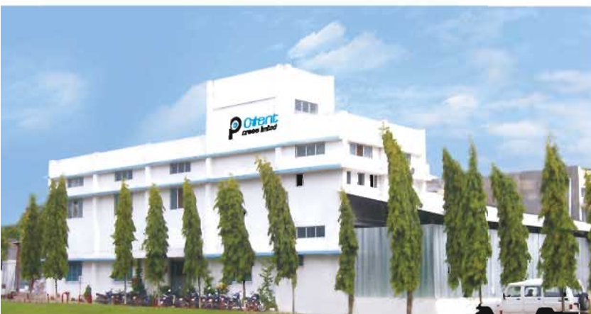
Silvassa Unit - 1