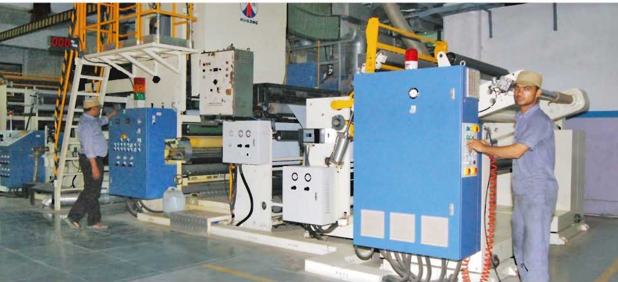
state-of-the-art extrusion lamination line