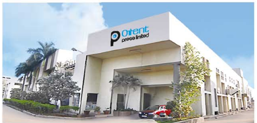
Tarapur Unit - 2