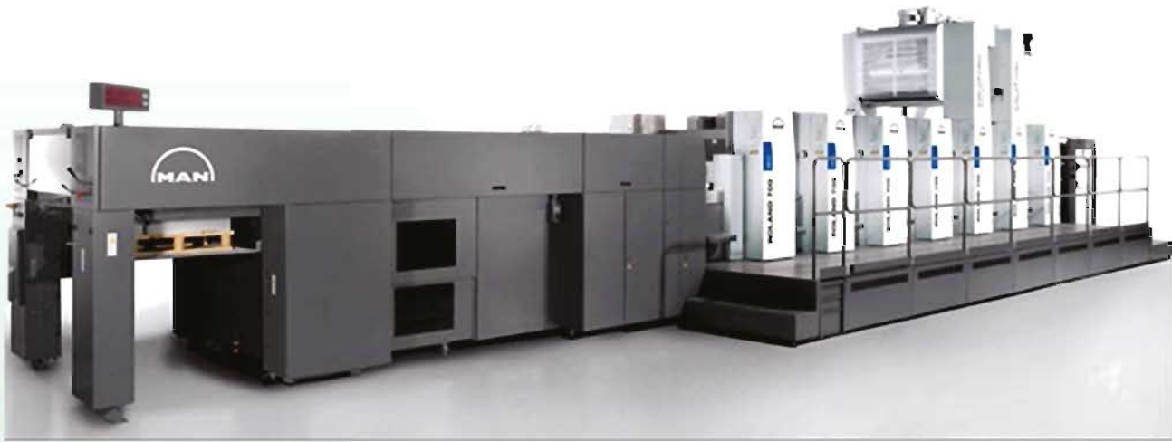
multi - colour UV offset printing machine