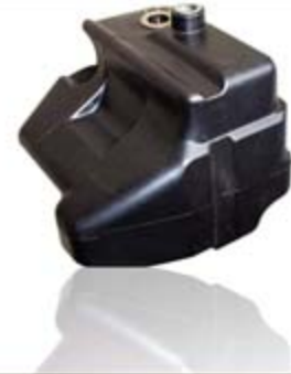
Same Fuel Tank