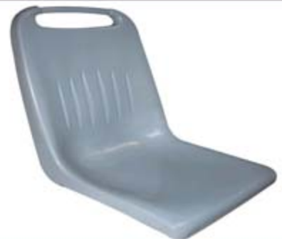
volvo city 2