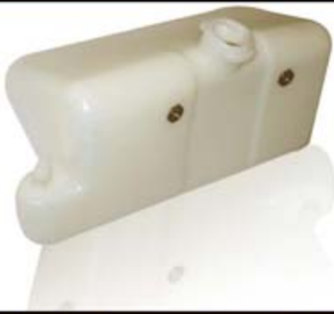
Vaso Expansion Tank