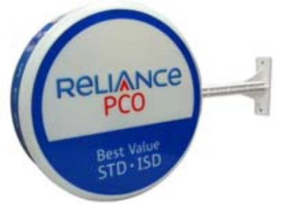
Pop Product 18