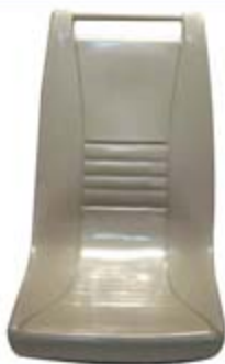
volvo city 1