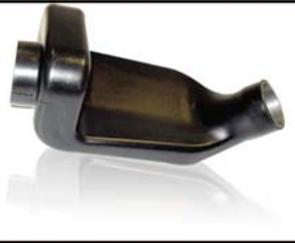
Ait filter hose