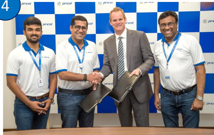
Joint-Venture With Zorg Industries for the Manufacture & Supply of Parking Assistance Systems