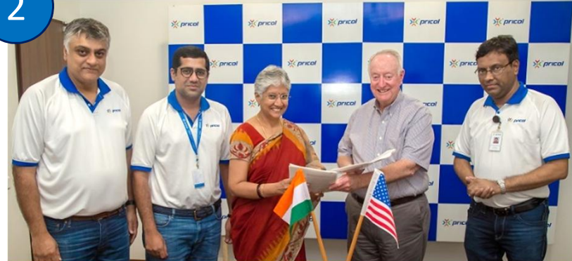
Entry into O 2 Sensors – Strategic Partnership with Kerdea Technologies