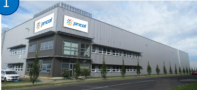
Acquisition of Wiping Business in August 2017