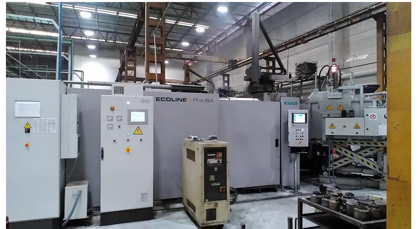
840T Die Casting Machine in Pricol do Brasil