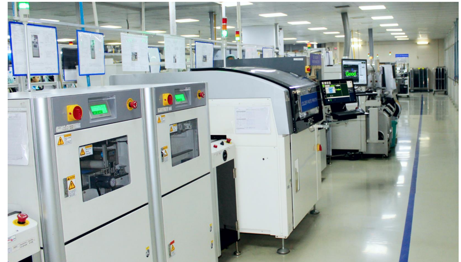
2 nd SMD line for PCB in Plant 2