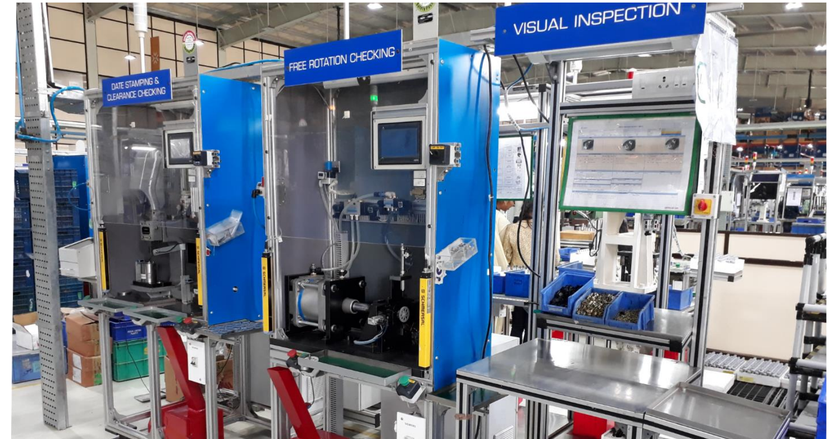
Oil Pump Assembly Line in Plant 3 for Royal Enfield