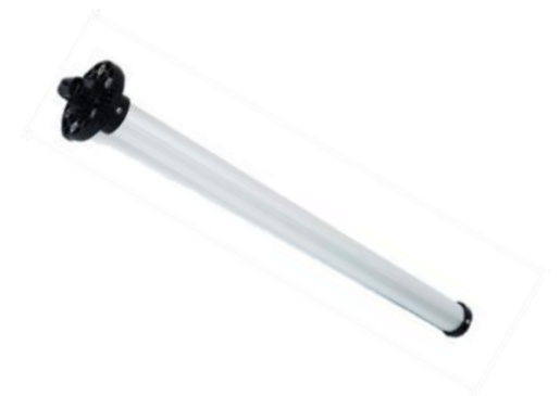
Fuel Level Sensor Non Fuel Contact Type