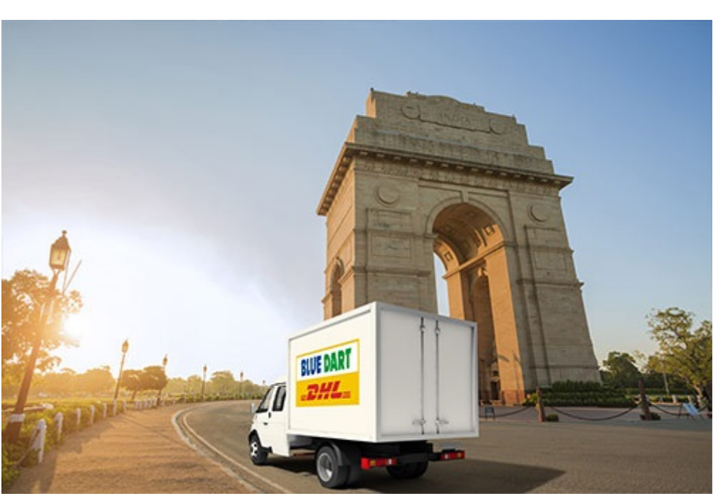
Blue Dart Financial Results for the Quarter April – June 2019.

• Additional clarification on Profit Before Tax, as per Ind AS 116