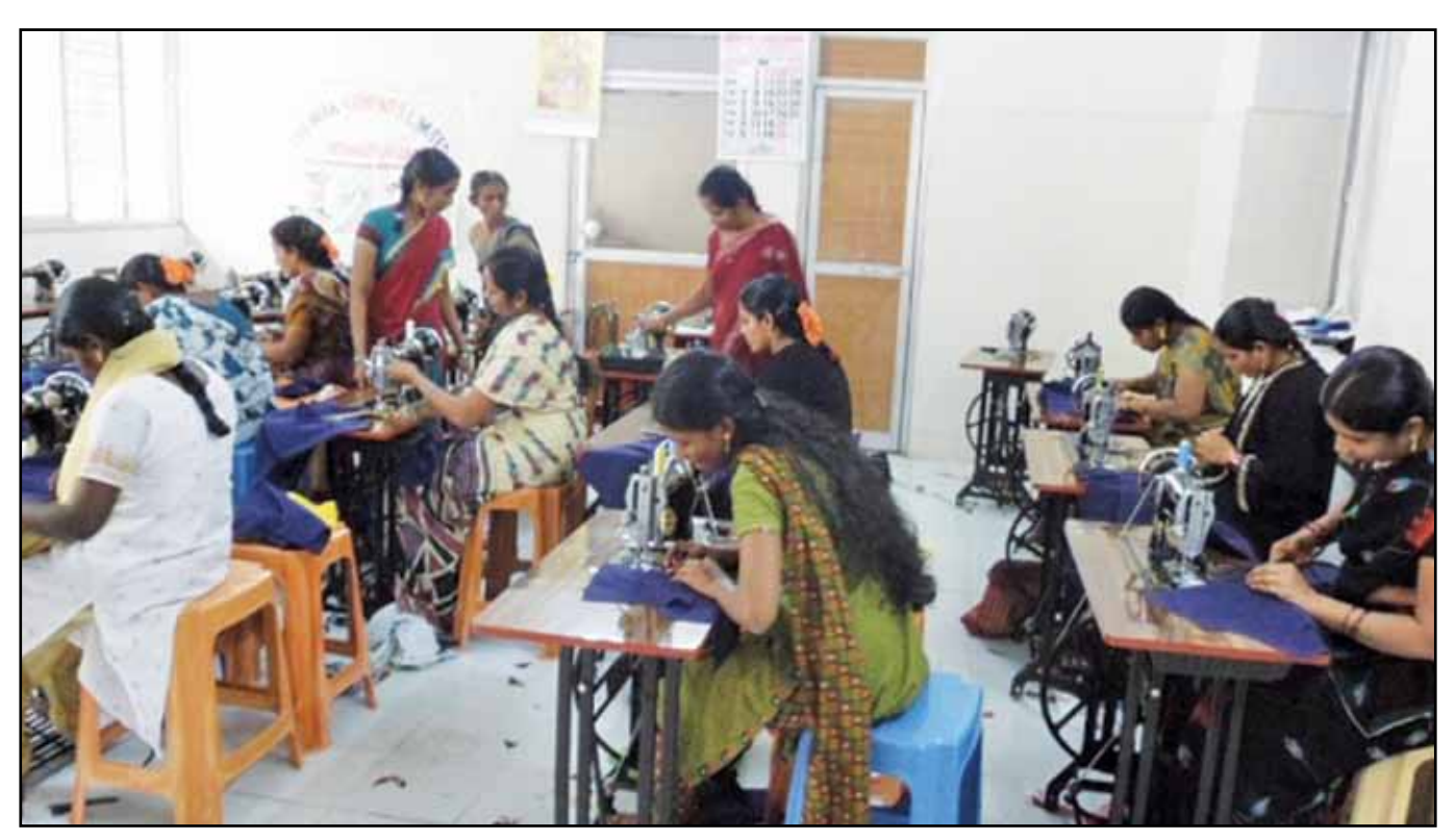
TAILORING CLASSES AT VISHNUPRAM FOR UNDERPRIVILEGED WOMEN