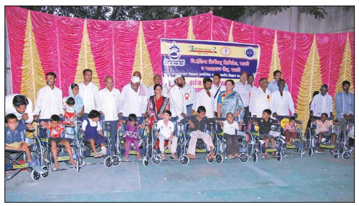
DISTRIBUTION OF WHEEL CHAIRS TO DISABLED CHILDREN AT PARLI GRINDING UNIT