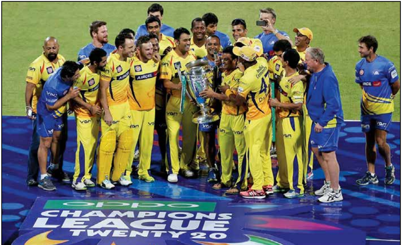
CHENNAI SUPER KINGS ARE CHAMPIONS OF CHAMPIONS