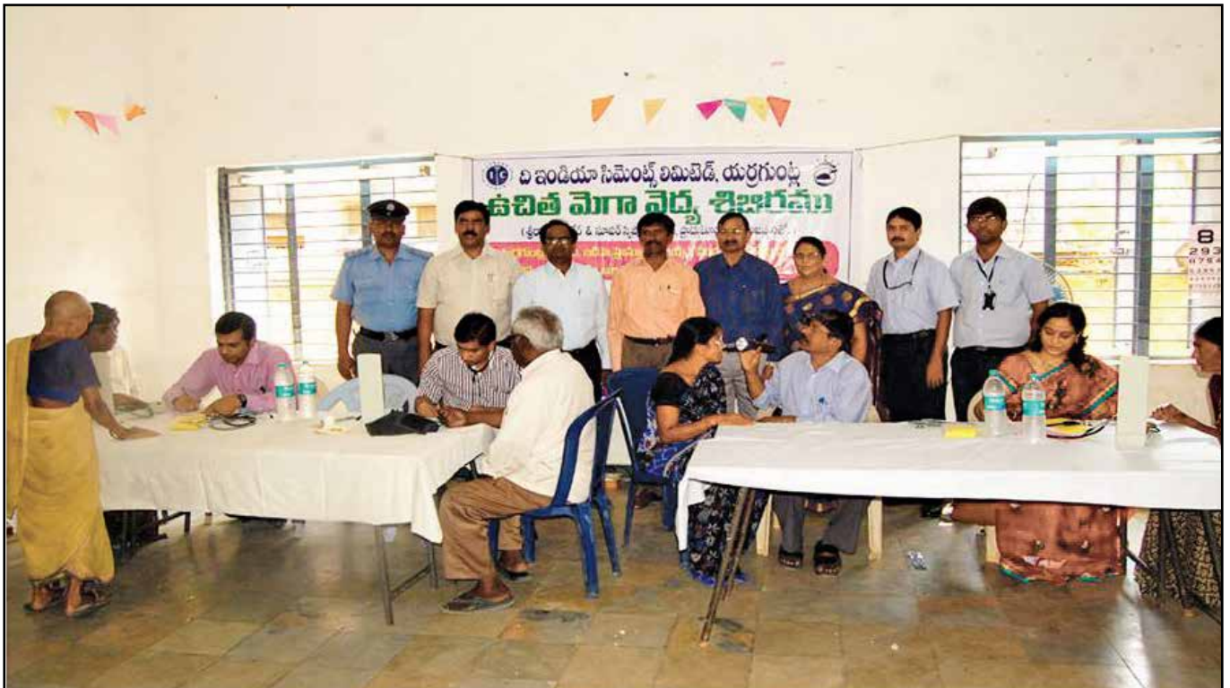
MEGA MEDICAL CAMP AT YERRAGUNTLA FOR GENERAL PUBLIC