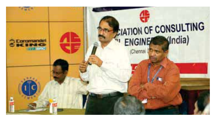
COROMANDEL SRC CEMENT (SULPHATE RESISTANT CEMENT)