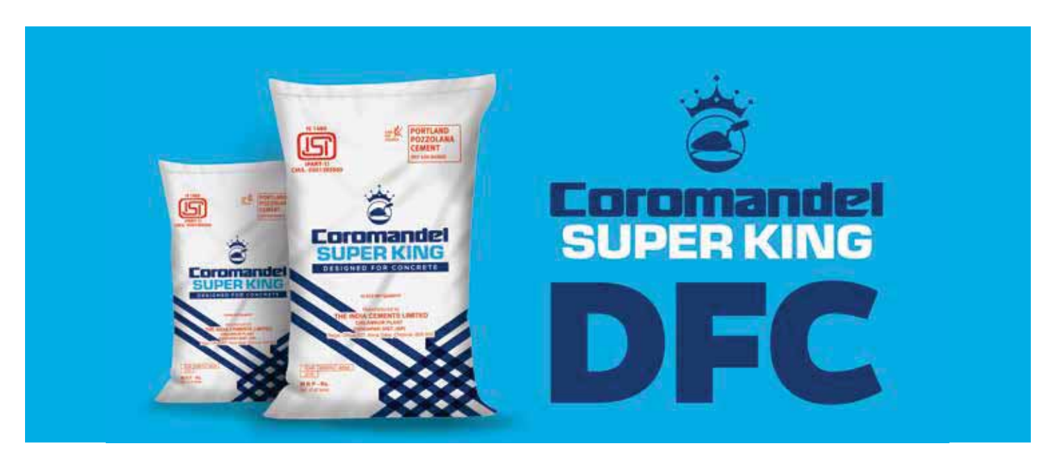
COROMANDEL SUPER KING DFC (DESIGNED FOR CONCRETE)