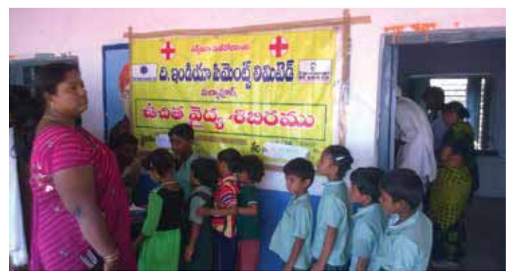
MEDICAL CAMP ORGANIZED BY MALKAPUR WORKS