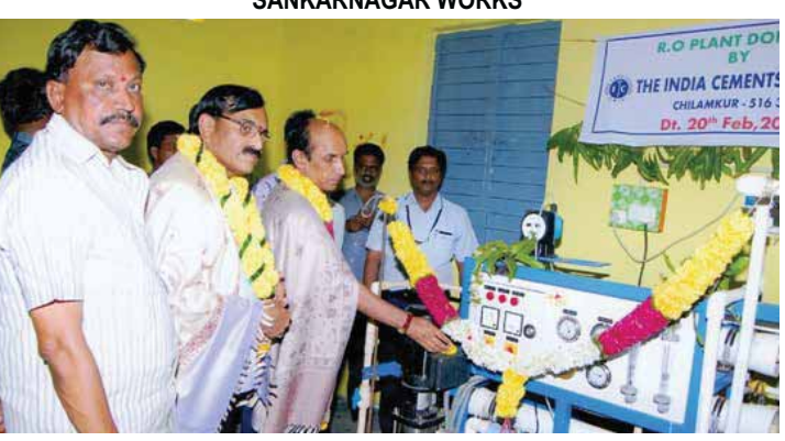
WATER PURIFIER PROVIDED TO VILLAGERS BY CHILAMAKUR WORKS