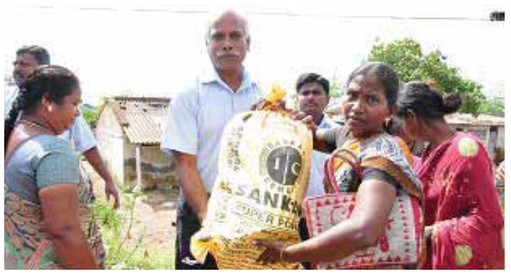
DISTRIBUTION OF FLOOD RELIEF MATERIALS BY CHENNAI GRINDING UNIT