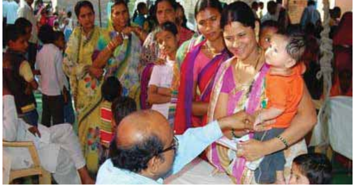
HEALTH CAMP ORGANISED BY PARLI GRINDING UNIT