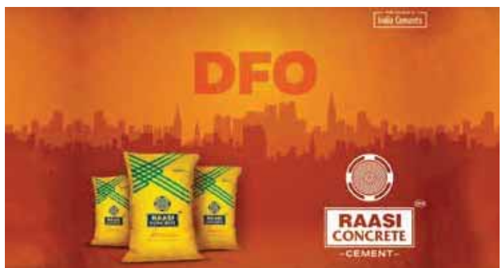
RAASI CONCRETE CEMENT (DESIGNED FOR ORISSA)