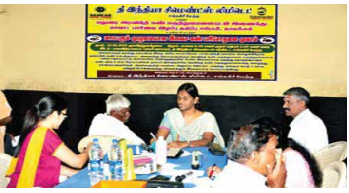
MEDICAL CAMP FOR VILLAGERS ORGANISED BY SANKARI WORKS