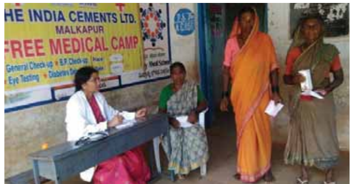
MEDICAL CAMP ORGANIZED BY MALKAPUR WORKS