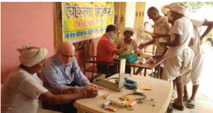
HEALTH CARE CAMP ORGANISED BY BANSWARA WORKS