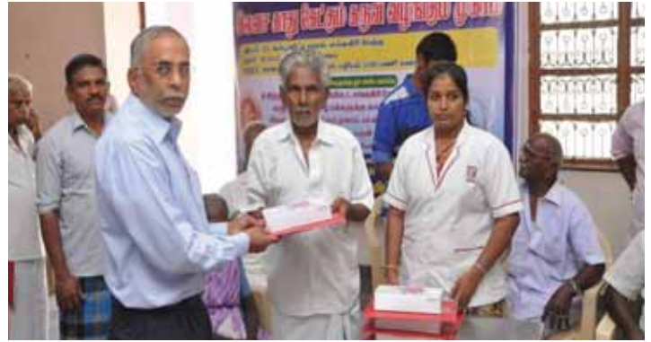
DISTRIBUTION OF HEARING AIDS AT SANKARI