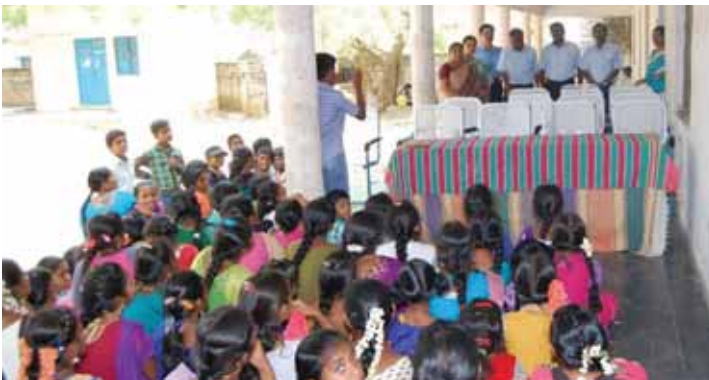
DISTRIBUTION OF STEEL CHAIRS TO ZP GIRLS SCHOOL, VISHNUPURAM