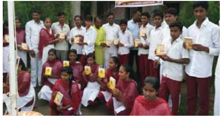
DISTRIBUTION OF DICTIONARIES BY PARLI GRINDING UNIT