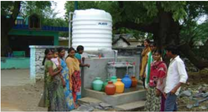
RURAL DRINKING WATER FACILITY TO VILLAGERS BY YERRAGUNTLA WORKS