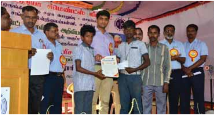
DISTRIBUTION OF CASH AWARD TO RANK HOLDERS AT SANKARNAGAR