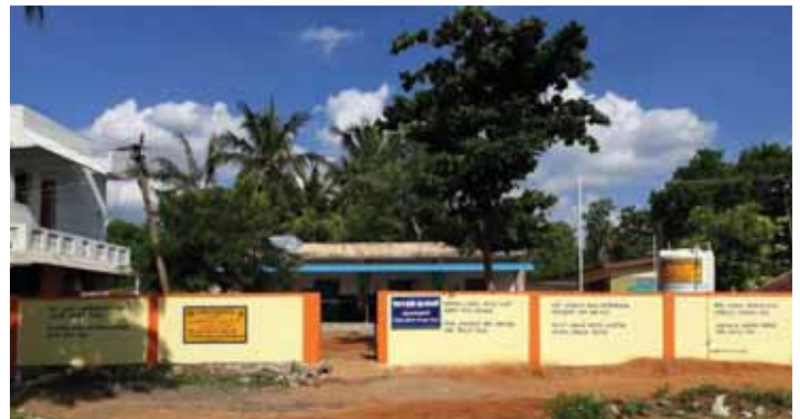
CONSTRUCTION OF COMPOUND WALL AT GOVT. SCHOOL, DALAVOI