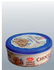
Slip Lid Can