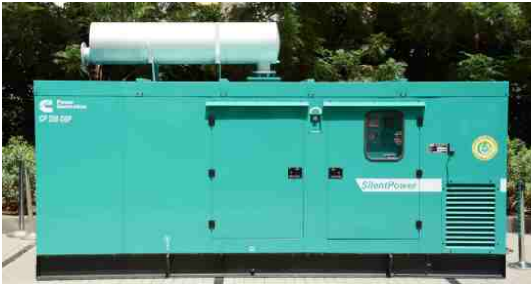
Power packed performance: The new, lean, fit for market 250 kVA generator set based on the L9 (8.9-litre) engine platform is all set to provide Cummins a competitive advantage in the markets.

We view our suppliers as strategic partners in bringing high quality, right first time products to the marketplace. Over the last two years, we have been focusing heavily on improving quality as this remains one of the most important parameters for our customers. In achieving zero defect in quality, we are aggressively pursuing the AMaZe program (Accelerated Move towards Zero defects). This program made substantial progress during the year in enhancing our customer satisfaction and market share. A total of 376 projects were undertaken which yielded significant progress through enhanced quality and reduction in early life failures.