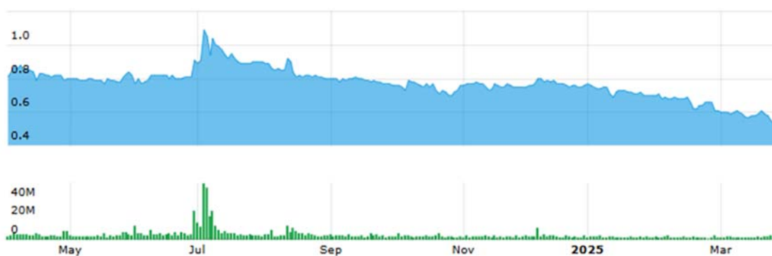
Stock Performance FY 2024-25

The performance of the Company's stock prices is given in the chart below: