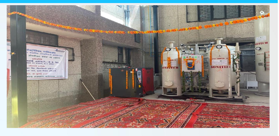
Medical Oxygen Generation Plants set up in 12 Govt. Hospitals across 6 States (Karnataka - 6, Uttar Pradesh - 2, Maharashtra - 1, Telangana - 1, Andhra Pradesh - 1, Tamil Nadu - 1)