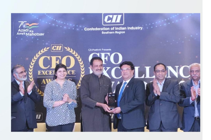
CII CFO of the Year - PSU category