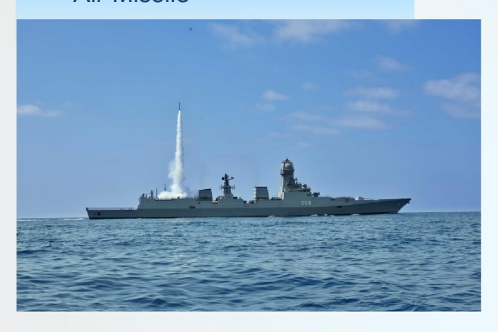
Fire Control System