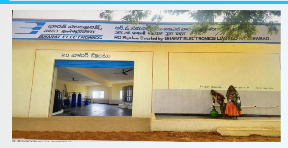
RO water plants installed in remote adopted village (Chowdammagutta Tnanda, Telangana)