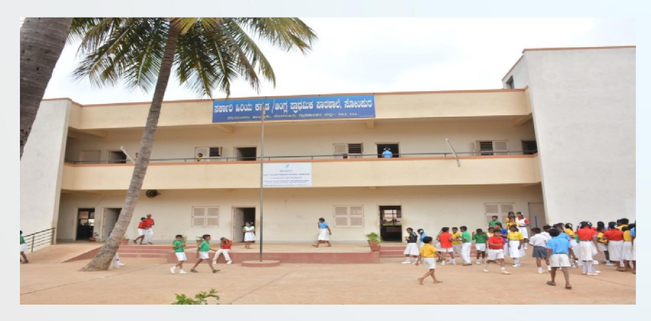
Govt. Higher Primary School, Nelamangala, Karnataka