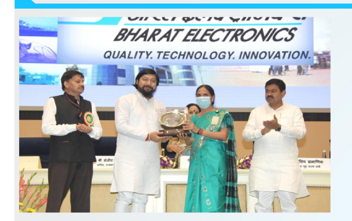
BEL Bags Rajbhasha Kirti Award