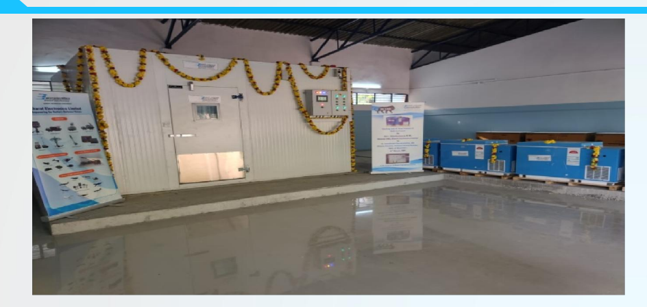
Cold-Chain Equipment (Deep Freezers & Walk-in Freezer) donated to Government of Karnataka for COVID-19 Vaccination program