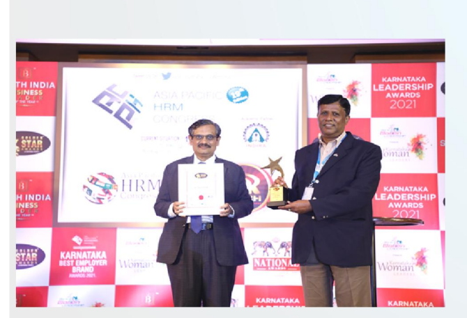
The Golden Star Outstanding R&D Leadership Award for Excellence and Leadership in Innovation