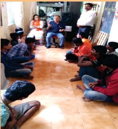
Medical session conducted at the Day Care Center by the Medical Incharge

FDC's program through 'SUPPORT' focuses on rehabilitation of Drugs usage by street children. The program continues to prove beneficial to all the residential children as they are showing normal growth in height and weight.