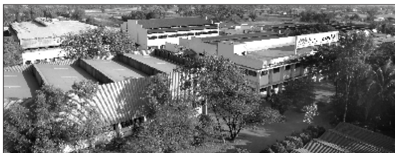
Menon Pistons Limited main manufacturing facility at Kolhapur.