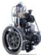
Agriculture, Construction & other Industries

The company has a wide range of non-auto engines are fuel efficient, compact and versatile prime movers for various non-auto applications.