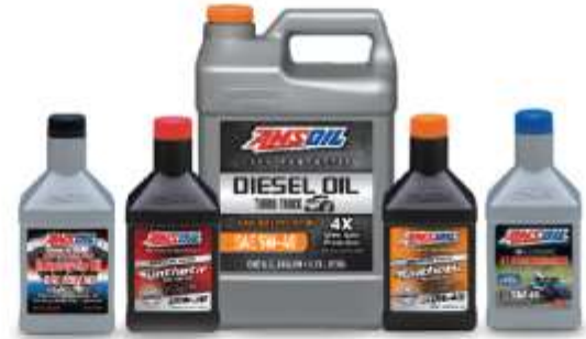
AMSOIL PREMIUM SYNTHETIC OIL