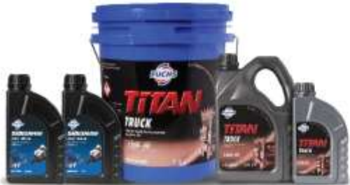
FUCHS MINERAL OIL