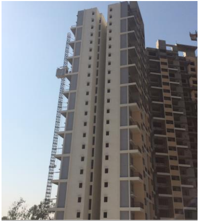
Antheia IIA (Dec'16)