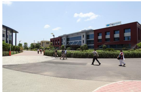
Capgemini facility, IT SEZ, MWCC