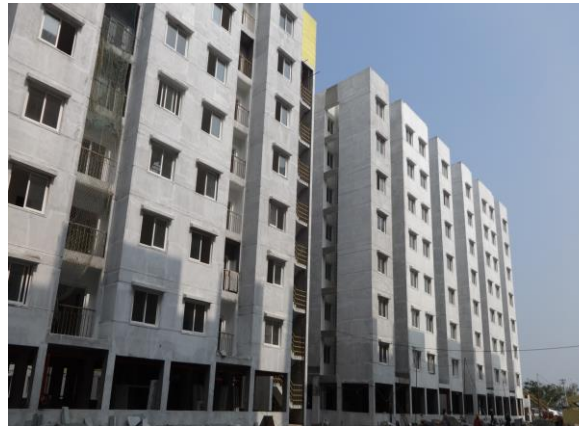
Nova Phase IIA (Dec'16)