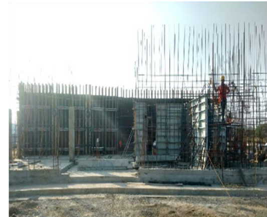
The Serenes (Dec'16)