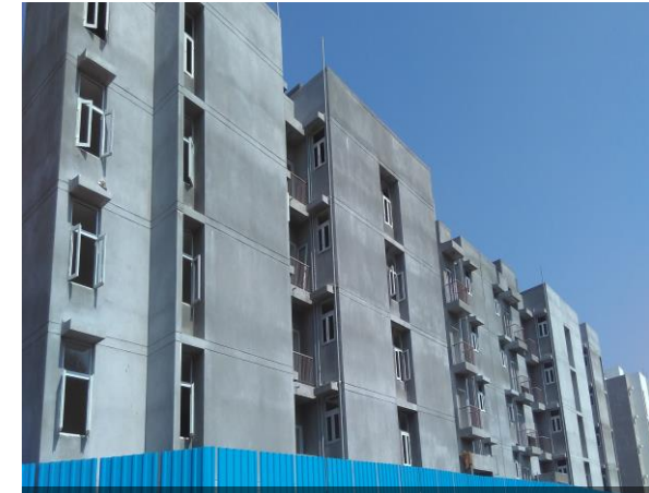
Happinest Boisar - Cluster K (Dec'16)