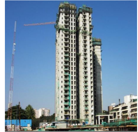
Windchimes I – (Dec'16)