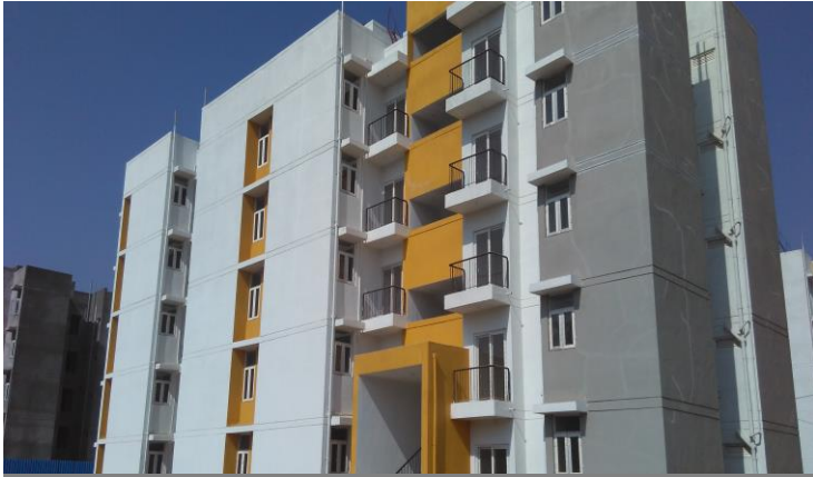
Happinest Boisar – Building J1 (Dec'16)