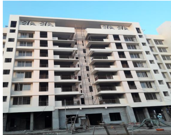
Bloomdale IIA (Dec'16)