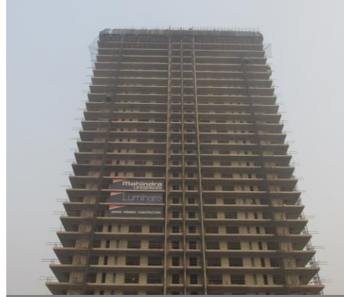
Luminare Phase I (Dec'16)