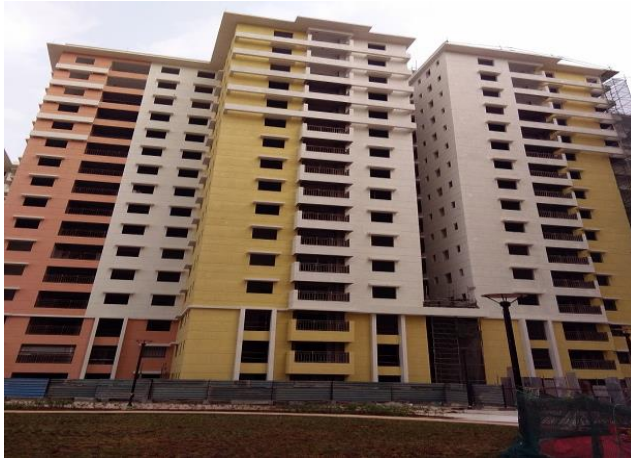
Ashvita V (Dec'16)