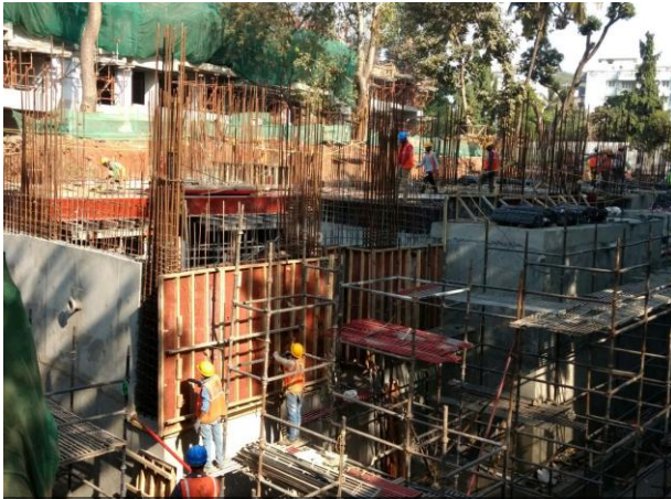
Vivante B3B4 (Dec'16)