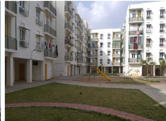
Happinest Avadi I – (Dec'16)