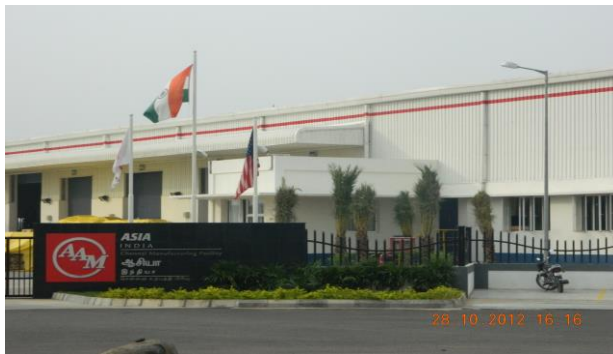
American Axle facility, DTA, MWCC