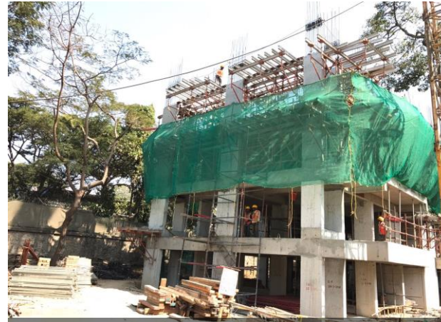
Vivante B1B2 (Dec'16)