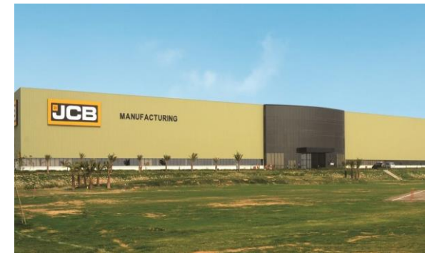
JCB facility, DTA, MWCC