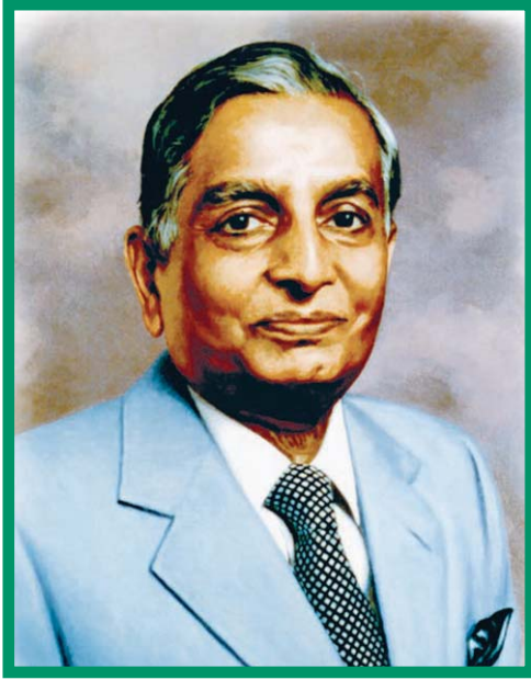
Syt. Madhav Prasadji Birla (1918-1990)