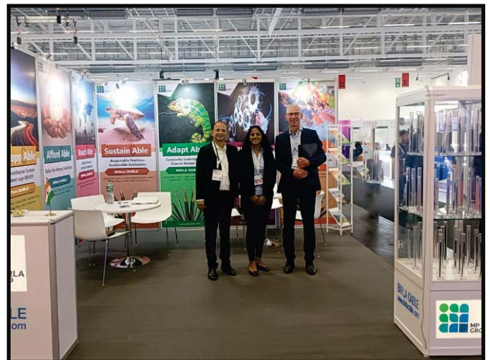
Participation in ECOC 2024 held at Frankfurt, Germany