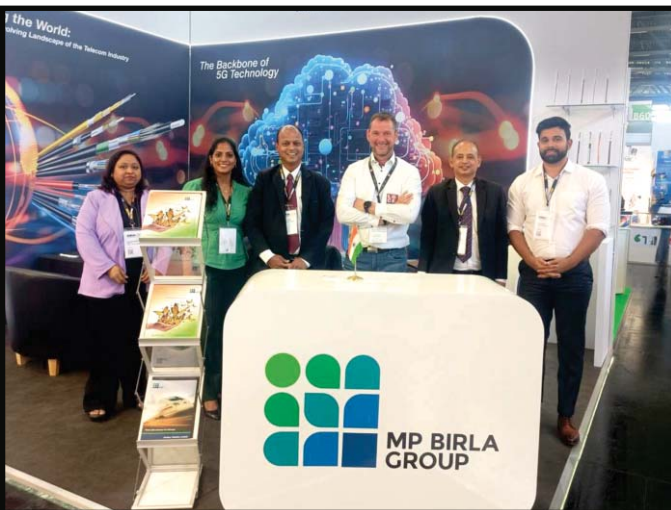
Participation in ANGACOM 2024 held at Cologne, Germany