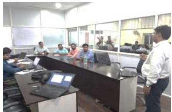
Product Presentation ACT24 series with Industrial customers. RPO engagement at All India Rubber Associations seminar