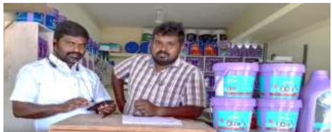
Bizom - Sales Force Automation driving Sales Team to engage with dealers. BTL activations for IPOL and Repsol in field conducted by our inspired team. Brand display at a dealer outlet.