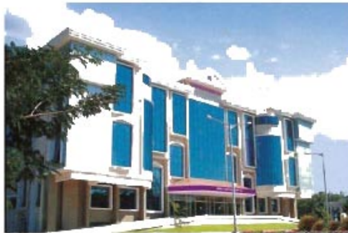
Corporate Office, Mangaluru

"To be a technology savvy, customer centric progressive bank with a national presence, driven by the highest standards of corporate governance and guided by sound ethical values."