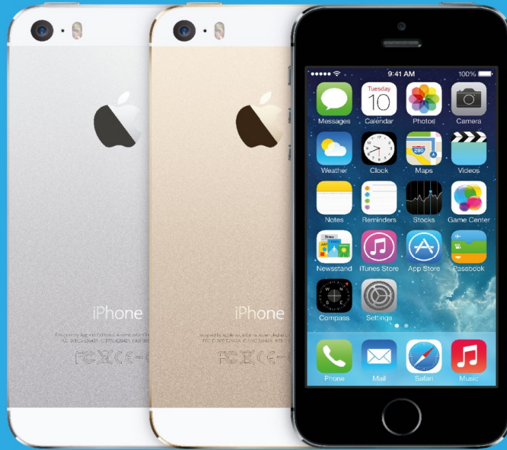
Apple iPhone 5s