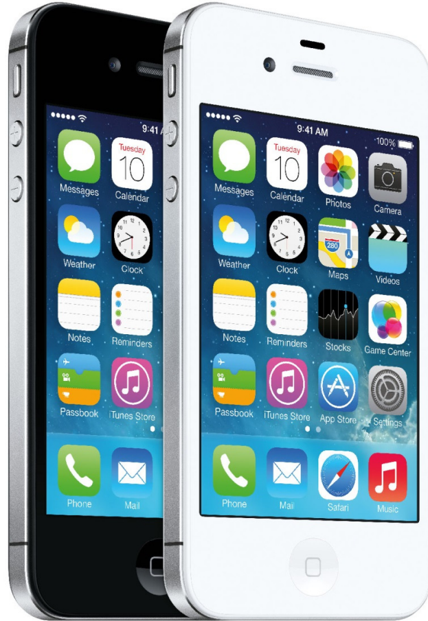
Apple iPhone 4s

includes Unlimited Calls, Data and Roaming.