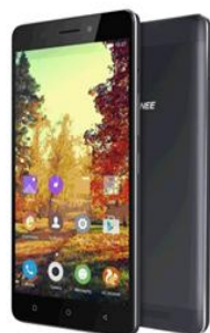
Gionee Marathon M5