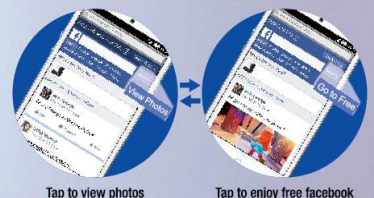
Tap to view photos

Stay connected to your family and friends all the time!