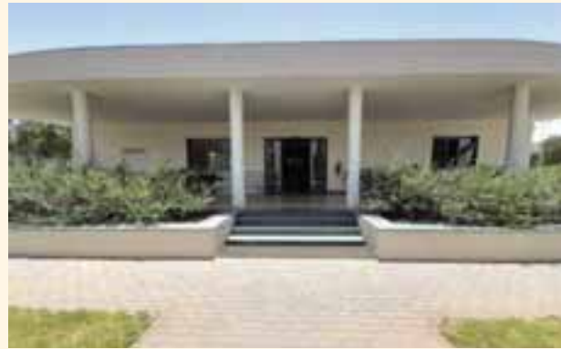
Child Health – Investing for Future

The Company's human capital is its most important off-balance sheet asset.