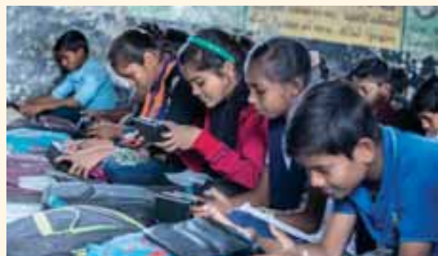
Siksha Setu – Improving Quality of Education