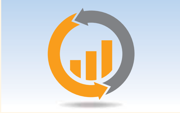
Growth and Value Cycle