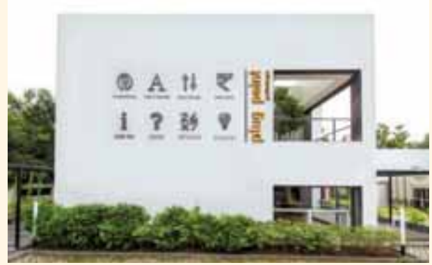
Plug Point – Customer Convenience