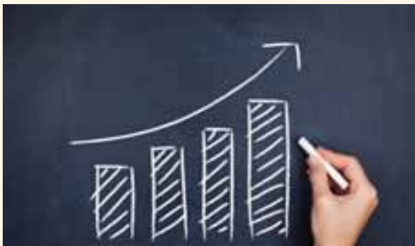
Focus on Long Term Financial Health

The Company seeks to enhance the quality of its growth and earnings by setting them within a corporate governance philosophy based on the core principles of transparency, integrity and accountability.