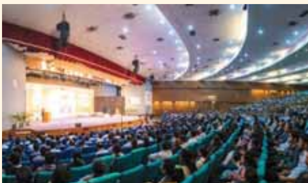
Founders' Day 2019 – Fostering the Spirit of Parivaar

"Pratiti" is an initiative to develop beautifully landscaped gardens in the city of Ahmedabad for the general benefit of citizens and increasing the green cover of the city.