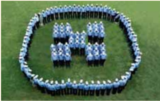
Human Capital Builds Our Brand