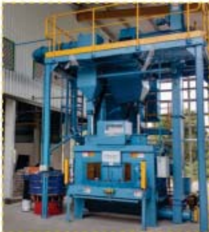
Wheelabrator DRT Shot Peening Machine at Avtec