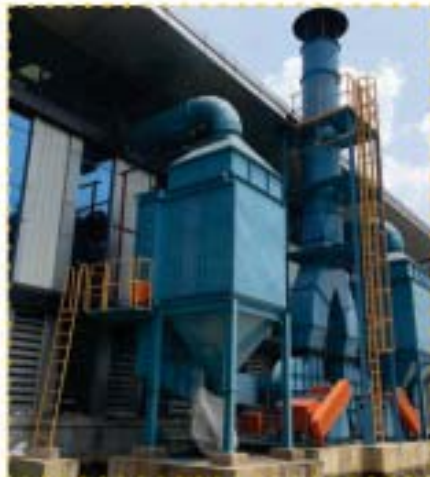
DISA Dust Extraction System at Walton