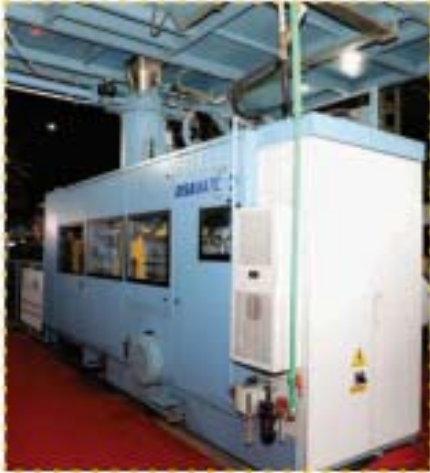
DISAMATIC C3-150 at Om Metal Cast