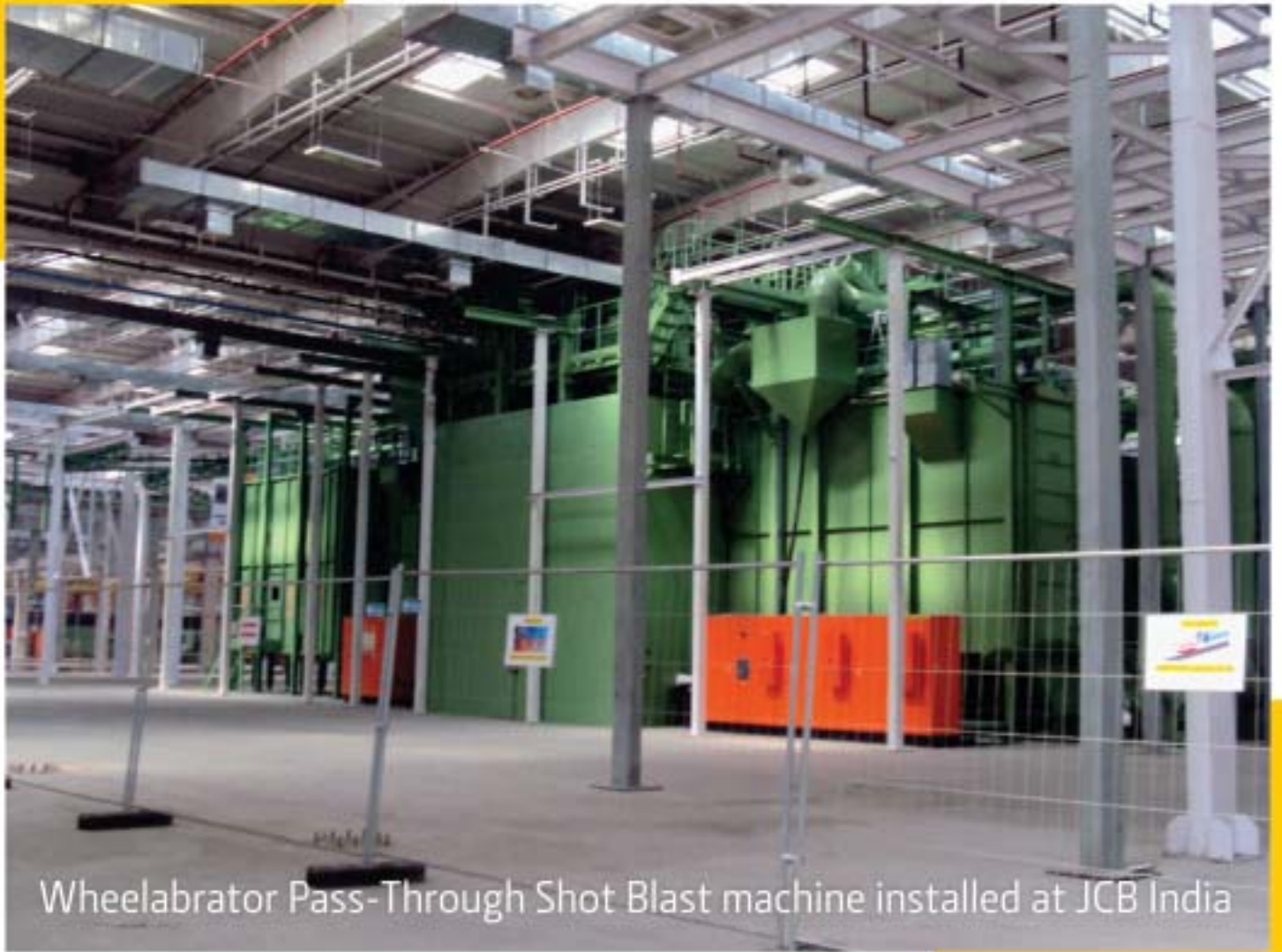
Wheelabrator Pass-Through Shot Blast machine installed at JCB India