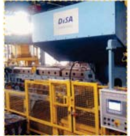
DISA FLEX 90 at Atul