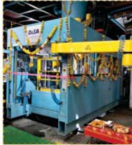
DISA MATCH 24/28 at Ashta Liners