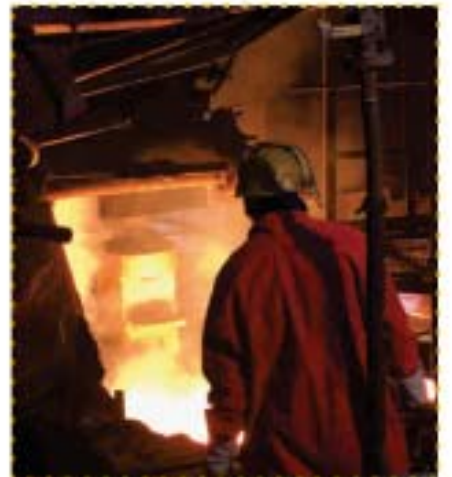
DISA Fume Extraction System at Sesa Goa