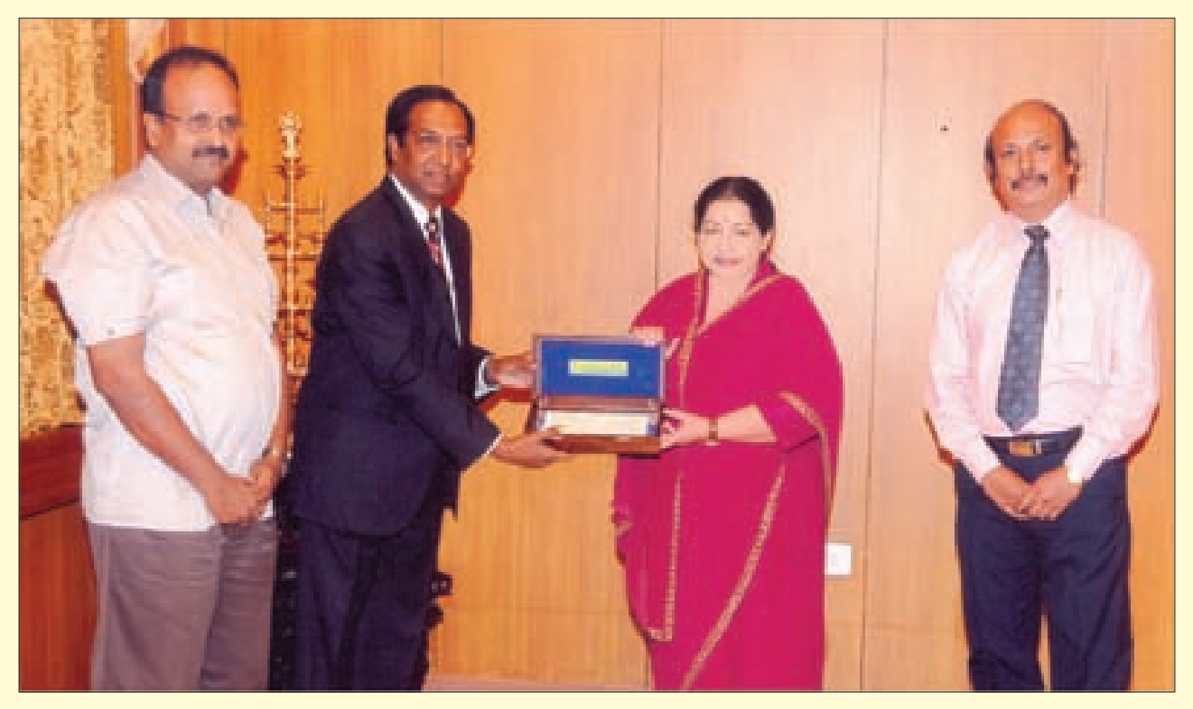
Donation to Tamilnadu Chief Minister's Thane Cyclone Relief Fund