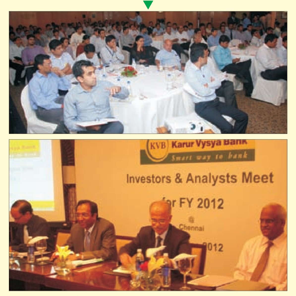
Investors & Analysts Meet at Chennai