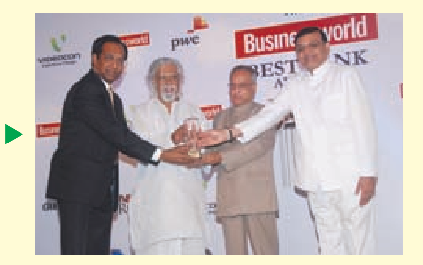
"Best Small Bank" & "The Fastest Growing Small Bank" Business World -Price Waterhouse Coopers Best Bank Awards, 2011

"Best Private Sector Bank" Bloomberg UTV Financial Leadership Awards, 2012