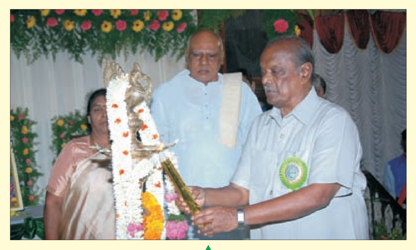
FOUNDERS' DAY CELEBRATIONS @ Madurai