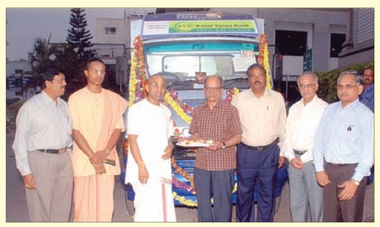
Donating a Van to Akshaya Patra Foundation of ISKCON for carrying mid-day meals to under privileged school children