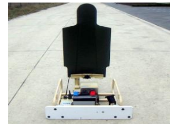
Smart Target System