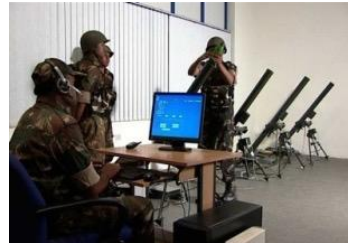
ZEN 81mm IMS