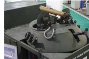
ZEN BMP II IMS