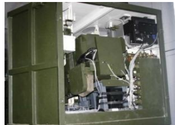
ZEN Tank Simulator