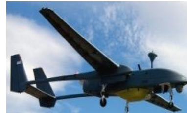
UAV Mission Simulator