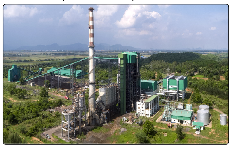
Thermal Power Plant at Saggonda