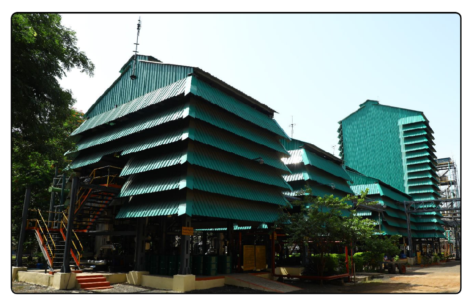
Rocket Propellent (HTPB) Production Plant at Tanuku