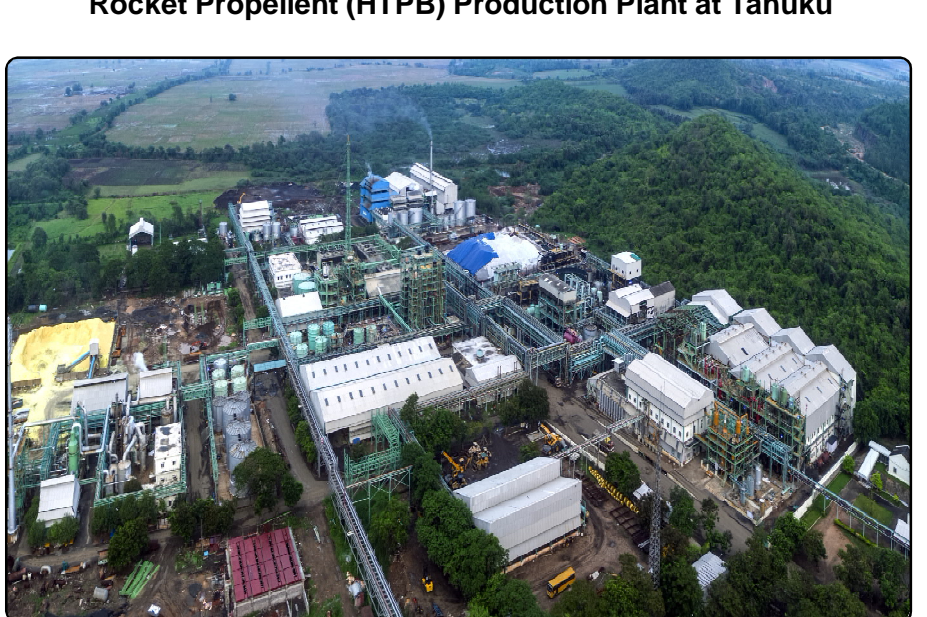
A Bird's Eye view of Chemical Complex at Saggonda