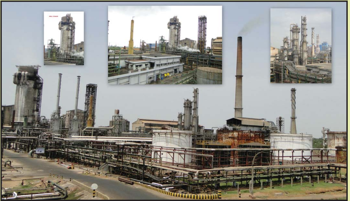
Madras Fertilizers Limited Manali Plant