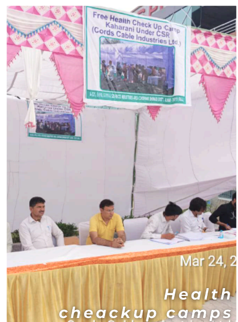
Mar 24, 2020 Health checkup camps