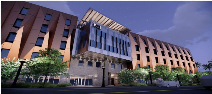
Detailed Design and Construction of ASU Campus and Facilities.