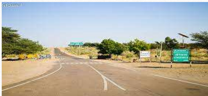
Operation & Maintenance Of Descoped Length Of 2 Lane With Paved Shoulder Tanot-Jaisalmer To Jaisalmer Bypass. In The State Of Rajasthan.