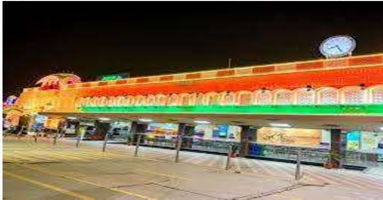
Major upgradation of Gandhinagar (Jaipur) Railway Station of Jaipur Division of North Western Railway through EPC.