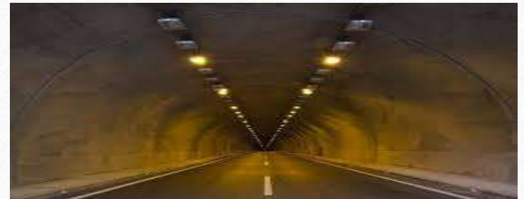
Construction of single line BG cut & cover tunnels from in between stations Kawnpui to Sairang including counterfort retaining wall on pile foundation & protection work along with all other ancillary works.