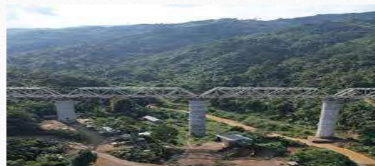
Construction of foundation and sub structure over pile foundation for Tall Bridge of new BG Railway line from Bairabi to Sairang (Mizoram).