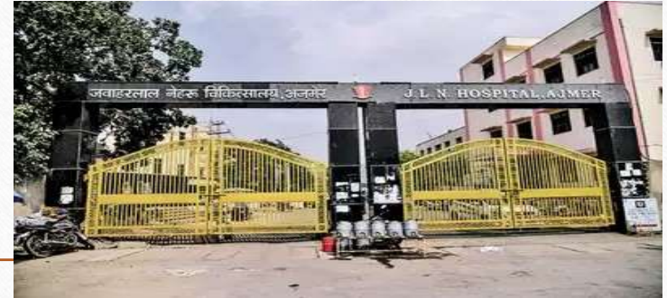
Construction of Medicine Block at JLN Hospital, Ajmer, Rajasthan.