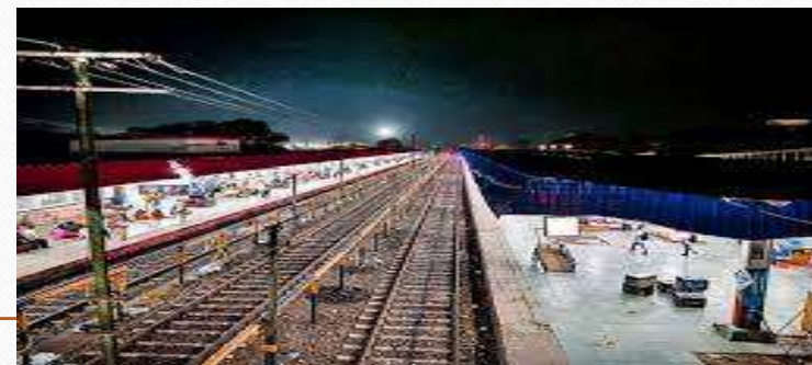
NBQ-GLPT-KYQ Doubling Project (Assam).