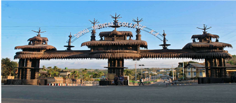
Construction Of Assam Hills Medical College & Research Institute, Diphu, Karbi Anglong.