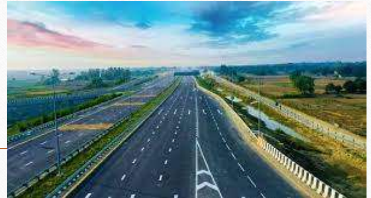
Maintenance of National Highways from Tihu to Puthimari section of NH-31 in the State of Assam.