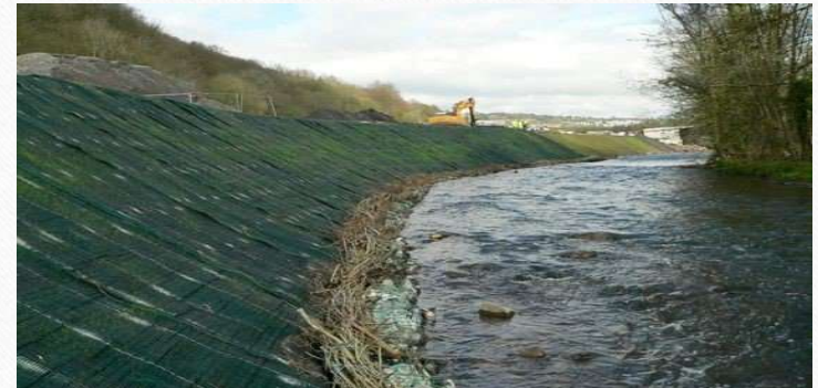
River Bank protection/erosion control measures on the left bank pf river Subansiri adjacent to village Gerki - 2 (RD 29 KM to - 30 KM)