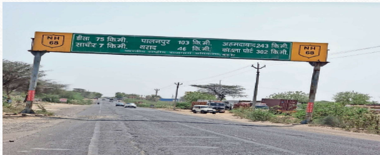
Short Term Improvement & Routine Maintenance of Two- Lane of NH-68 in the State of Rajasthan.