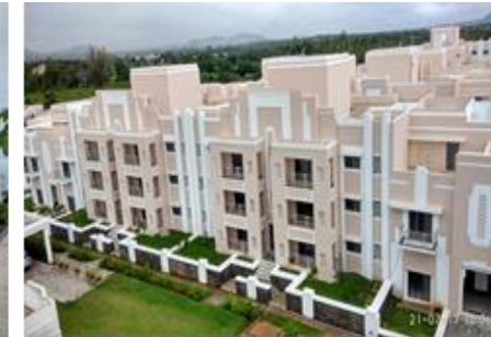
Row Houses & Town Homes