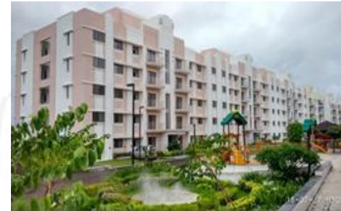
Building 2 - A,B,C