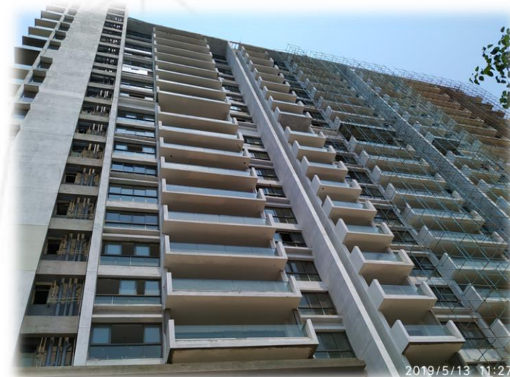
Tower A East View