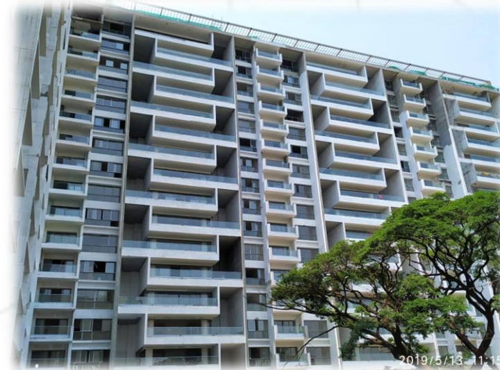
Tower B North View