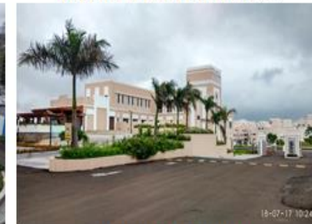
Amenity Building 1