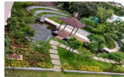
Amphi theater & Lily Pond